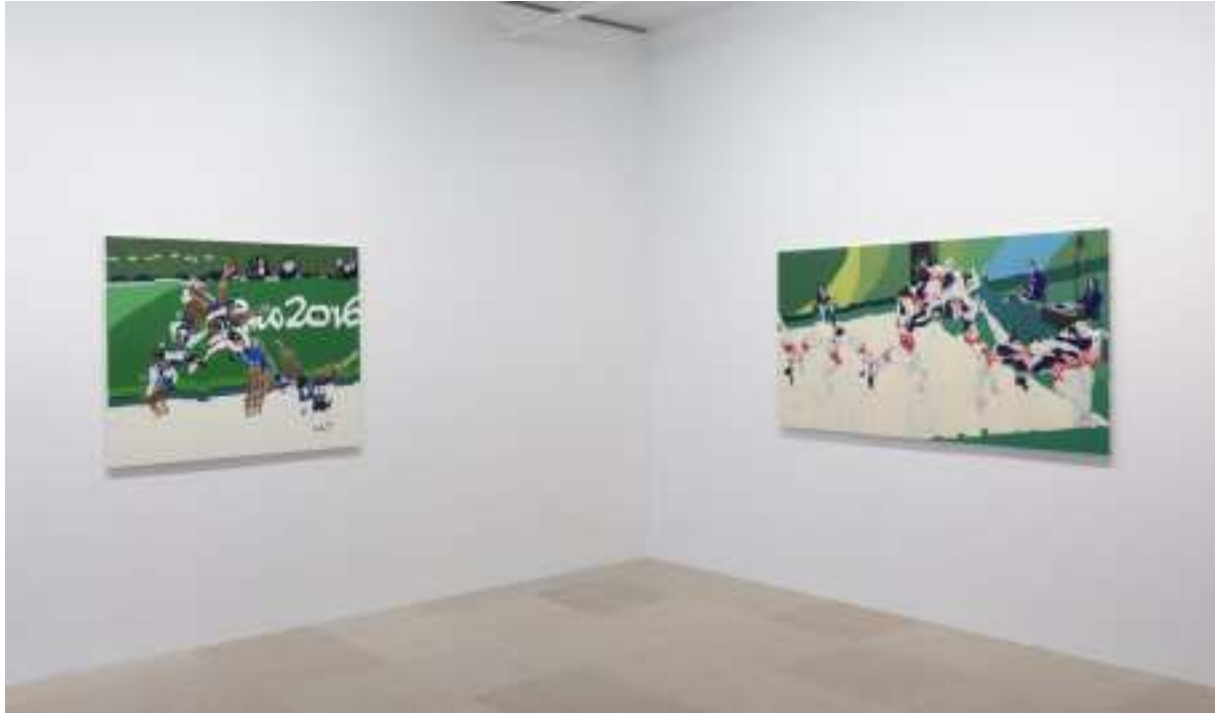
Installation view: "Painting: Now and Forever, Part III", Greene Naftali / Matthew Marks, New York 2018