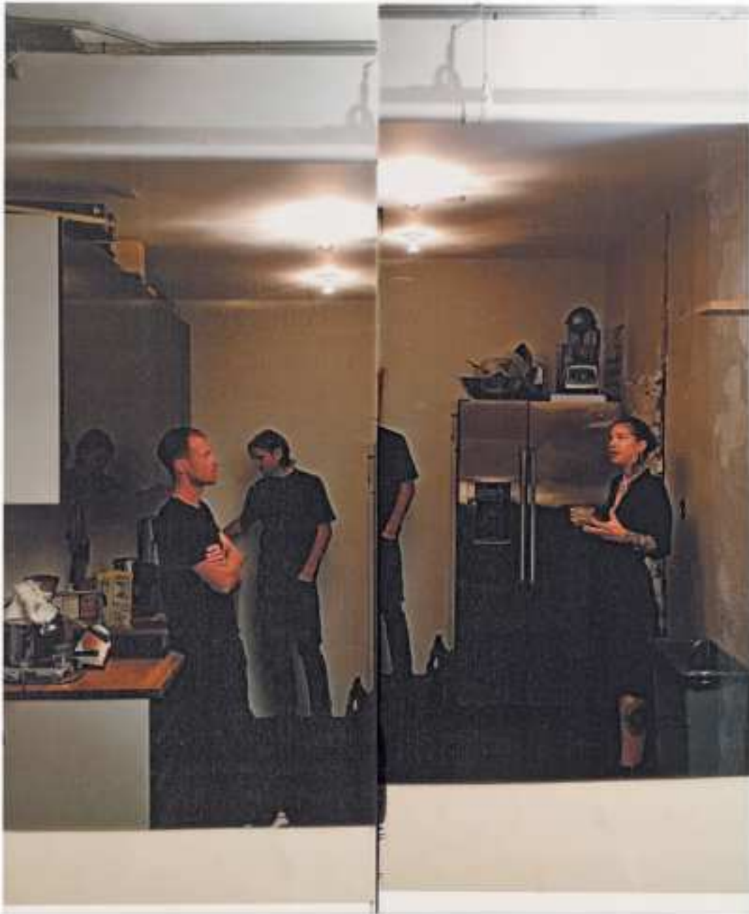
Wade Guyton: Untitled , 2016, ink-jet print on linen, 84 × 69" Jeanette er til venstre i billedet