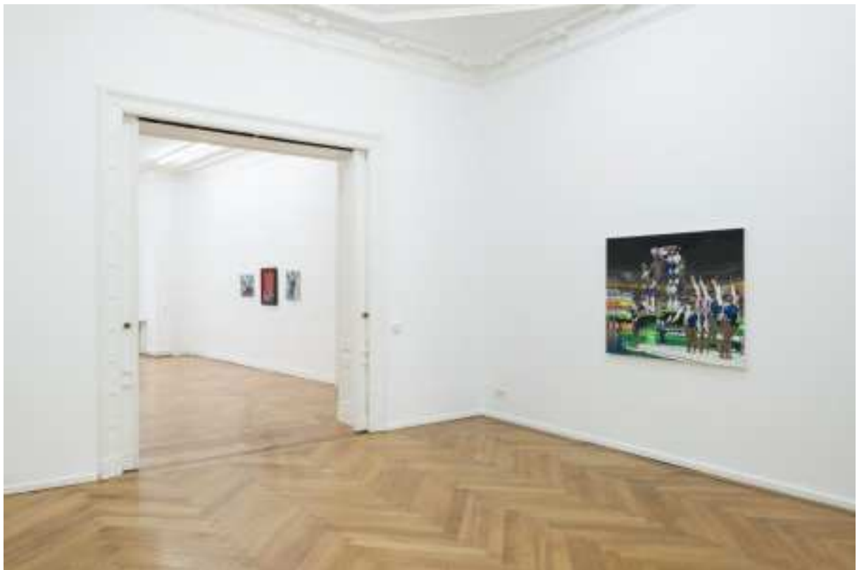
Installation view: "Lana Del Rey", Société, Berlin 2018