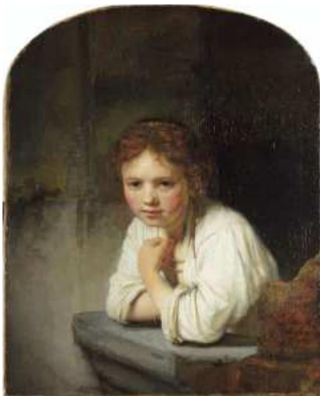
Rembrandt: Girl at a Window , 1645, Dulwich Picture Gallery, London