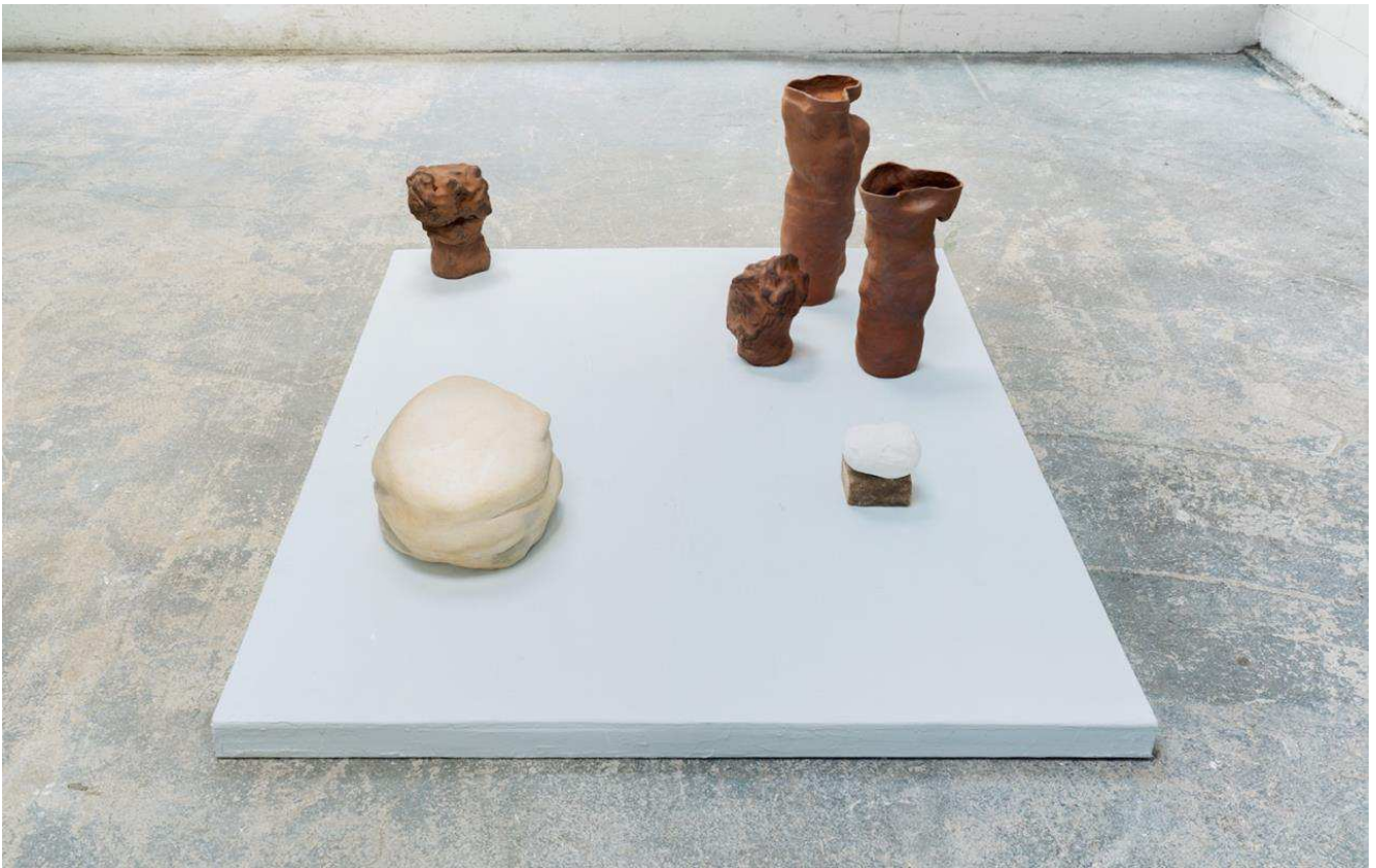
ERRATICS - Spencer Brownstone Gallery - New York / Linnéa Gad with sound installation by Will Epstein Curated by Jae Cho / July 19th - September 1, 2019