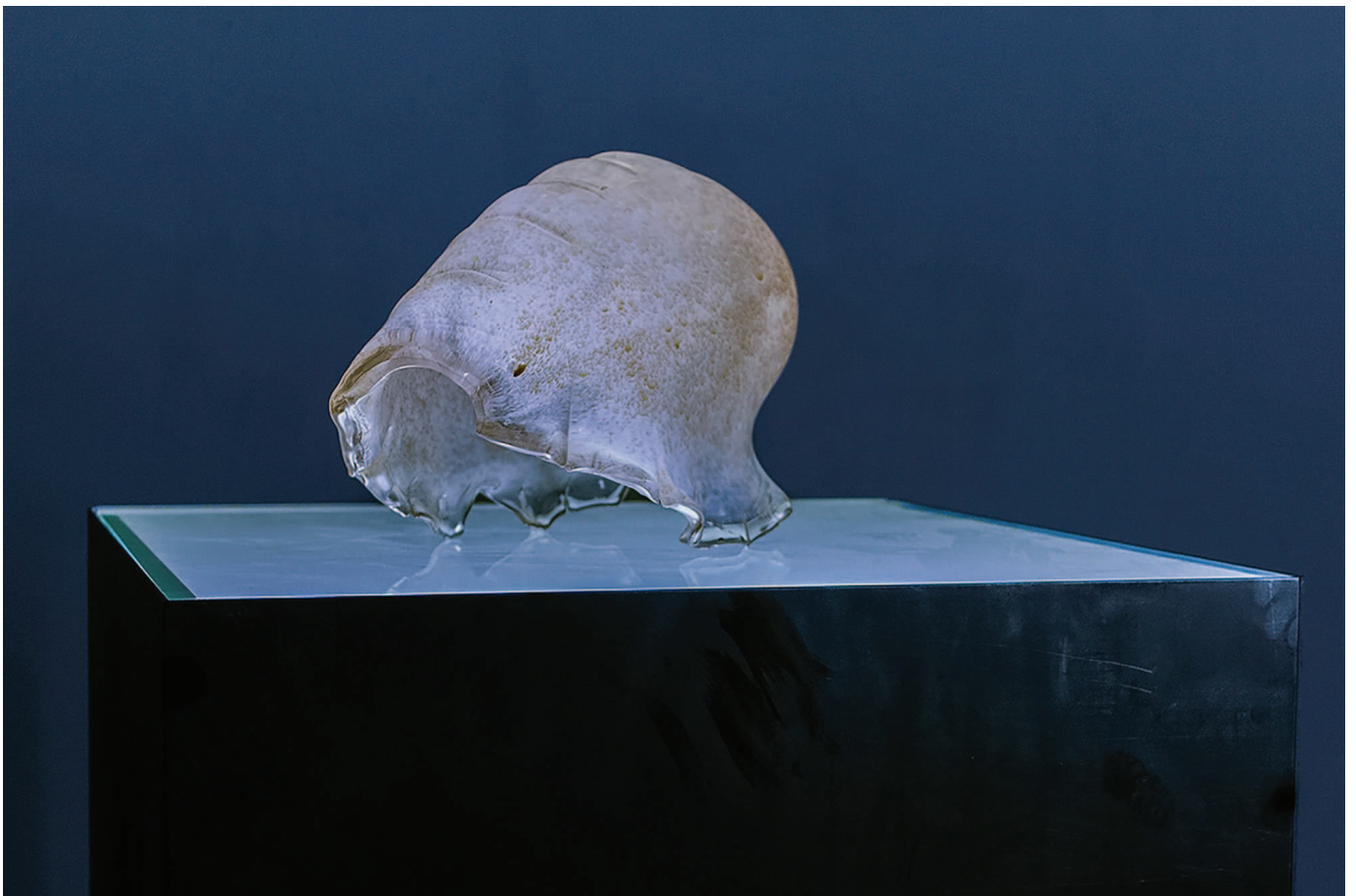
TAILS I-III (blown glass, coloring, glassplates, welded steel, led lights)