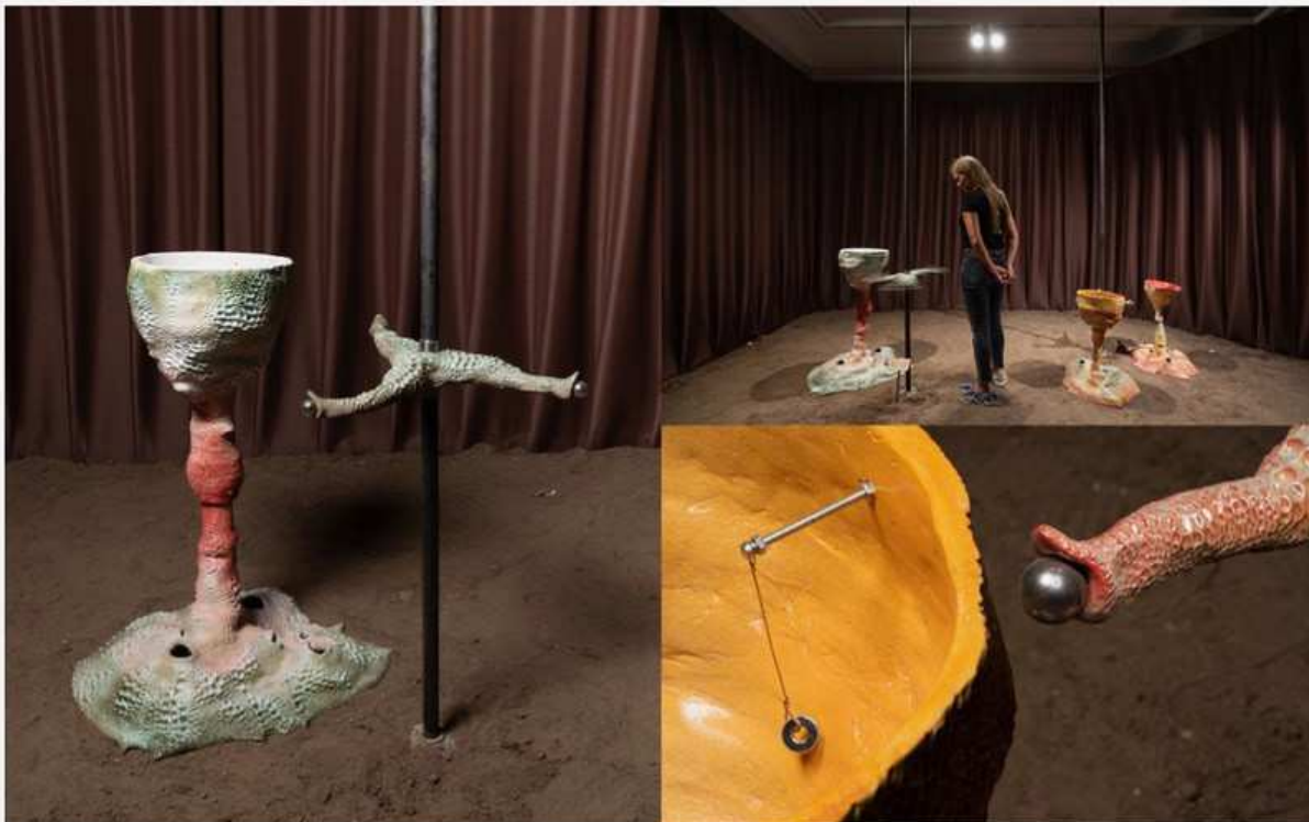
Mundlam Koral/Tungue Tied Corale

Keramisk Lydinstallation Stentøj, glasur, stål, magneter Var. Dim. FED LER Gl. Holtegaard , 2020-21