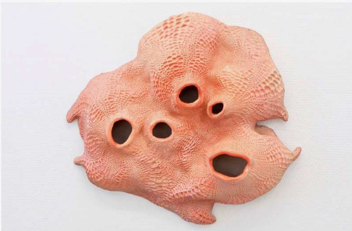
Drought Corale, peachy orange Stentøj, glasur, trådløs lydafspiller Lydbilledet er dekonstrueret lydoptagelser fra jorden, minder om lyden af åndedrag. 50X55x15 cm JCE Biennalen ,2019-2021

Keramisk Lydinstallation Stentøj, glasur, stål, magneter Var. Dim. FED LER Gl. Holtegaard , 2020-21