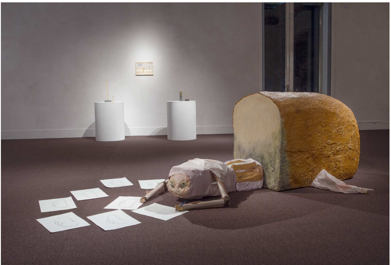
Installation view from Bonniers Konsthall. 2019. Time and Space. Performance costume for The Average Manifesto held at Bonnier Konsthall 2019. Stills from The Average. 2019. Reality Larva. Luleå biennalen. 2020