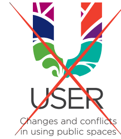
Do not change typography