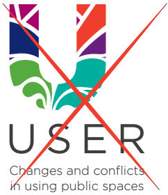
Do not change the alignment