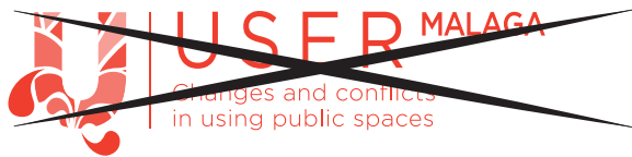
Keep the homothety