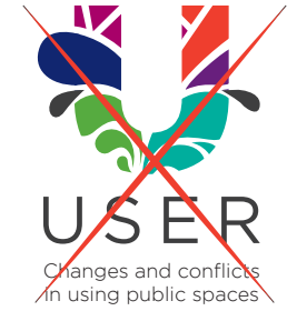
Do not add elements