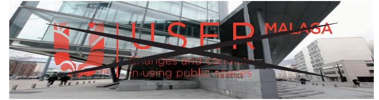
Use the right version on backgrounds