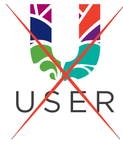
Do not use the logo without baseline