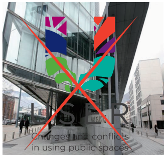
Use the right version on backgrounds