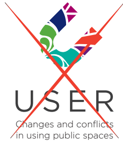
Do not move or scale elements separately