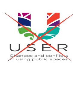
Keep the homothety