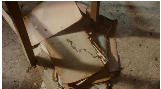
Images from a No Archive Can Restore You (2020).