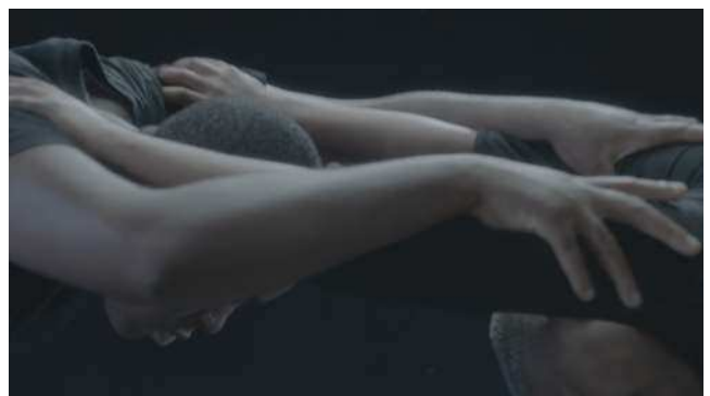
Images from the names have changed, including my own and truths have been altered (2019).