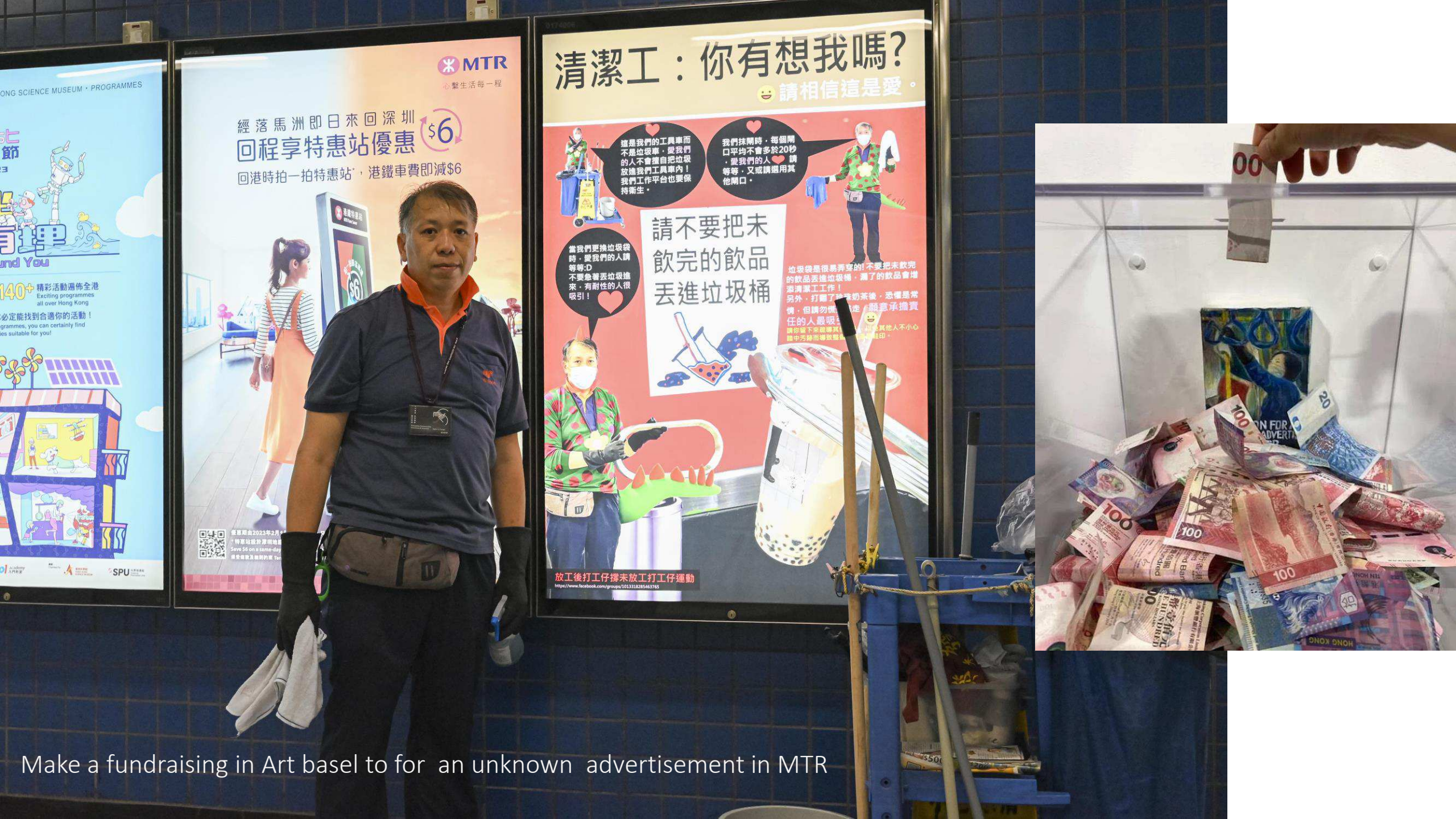
Make a fundraising in Art basel to for an unknown advertisement in MTR