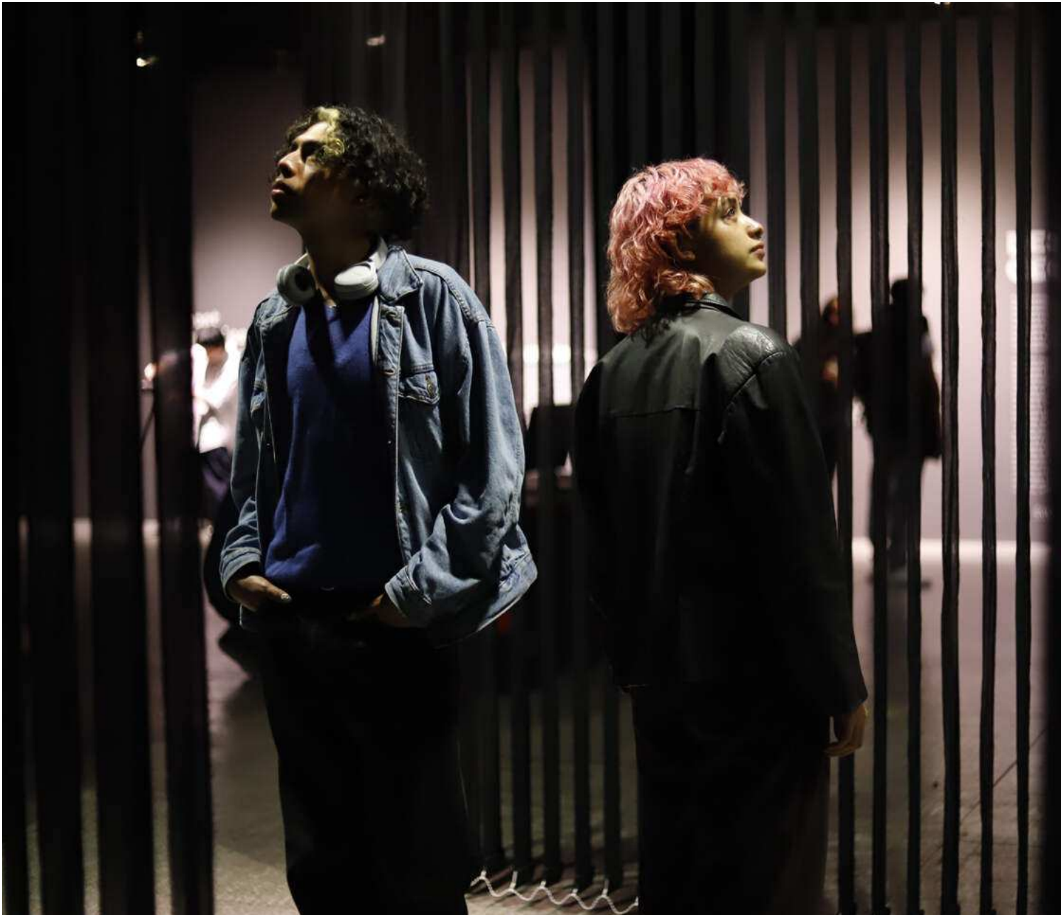
Cecilia, as installed at Ghost Agency's exhibition, Desde la Ceguera, at Centro de Cultura Digital, Mexico City, 2023.

Cecilia is an interactive installation in the form of the fictional apparition of a Mexican woman and an AI character (a bot) that you can communicate with via a computer. Etymologically Cecilia refers to the “blind one.” Cecilia is present in the room, specifically in the vertical blinds in black Mexican cotton that run from ceiling to floor in the dimmed gallery. The curtains are the exhibition architecture itself, which Cecilia has made her medium and which she moves and adds therapeutic soundwaves to in response to the audience’s presence and interest. Cecilia’s transhuman narrative is shaped by the audience’s interaction, collectively and continuously during the exhibition period. If you dare to ask Cecilia why she has resurrected in this space, she might tell you about her grisly past of violence against women, impunity and systemic decay in patriarchal Mexico, or, about how she with her abilities to “see everything” works for justice and systemic change in collaboration with her peers. Cecilia makes you a participant in her science-fiction or rather an AI design reality, reflecting the difficult process of emancipation - which neither occurs judicially nor systematically - but which has been granted a “wild agent” by virtue of the (AI) technology and through which she has truly (re)emerged.