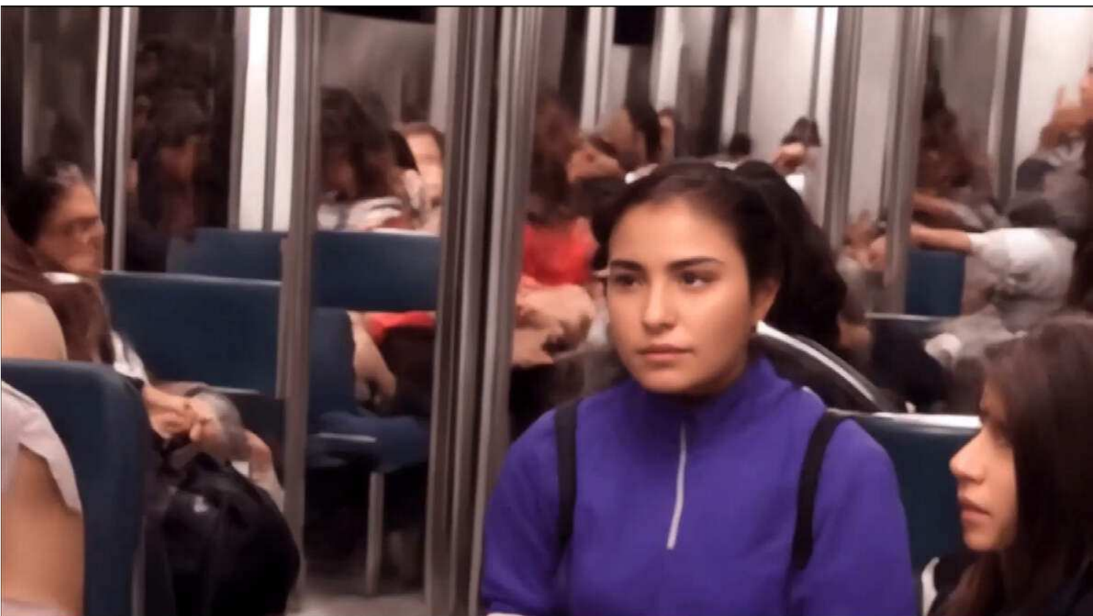
Stills from Ghost Agencies Prologue , 2023