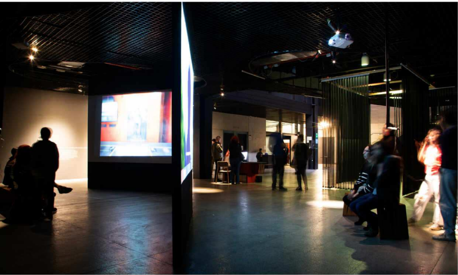
Desde la Ceguera (From Blindness) exhibition view at Centro de Cultura Digital, Mexico City.