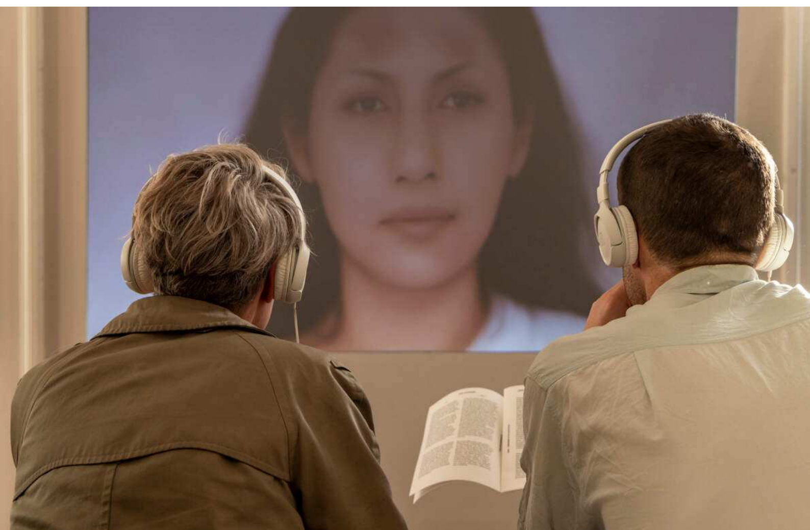
Ghost Agencies Prologue , at exhibition Fear and Fauna , ARIEL at Dag Hammarskjölds Allé 42D, Copenhagen, 2023.

'This video work reflects upon the intersection of AI, gender violence, and impunity. Using machine learning to replace and transform identities of found footage characters into appearing with elusive, obfuscated faces, builds a connection between the noise of information and the unsettling phenomena of disappearances prevalent in today's media landscape. This visual narrative portrays the constant violence women encounter across various spheres, spanning from public to private domains. It makes the figure of the ghost a metaphor for women in Mexican society and "the data-less", haunting the very same culture that annihilates and rejects them. It questions the paradoxical role of various technologies, marketed as solutions to combat violence, yet seemingly indifferent or unresponsive when it comes to the prosecution of these acts. Musical soundtrack by the Danish composer Ida Duelund.