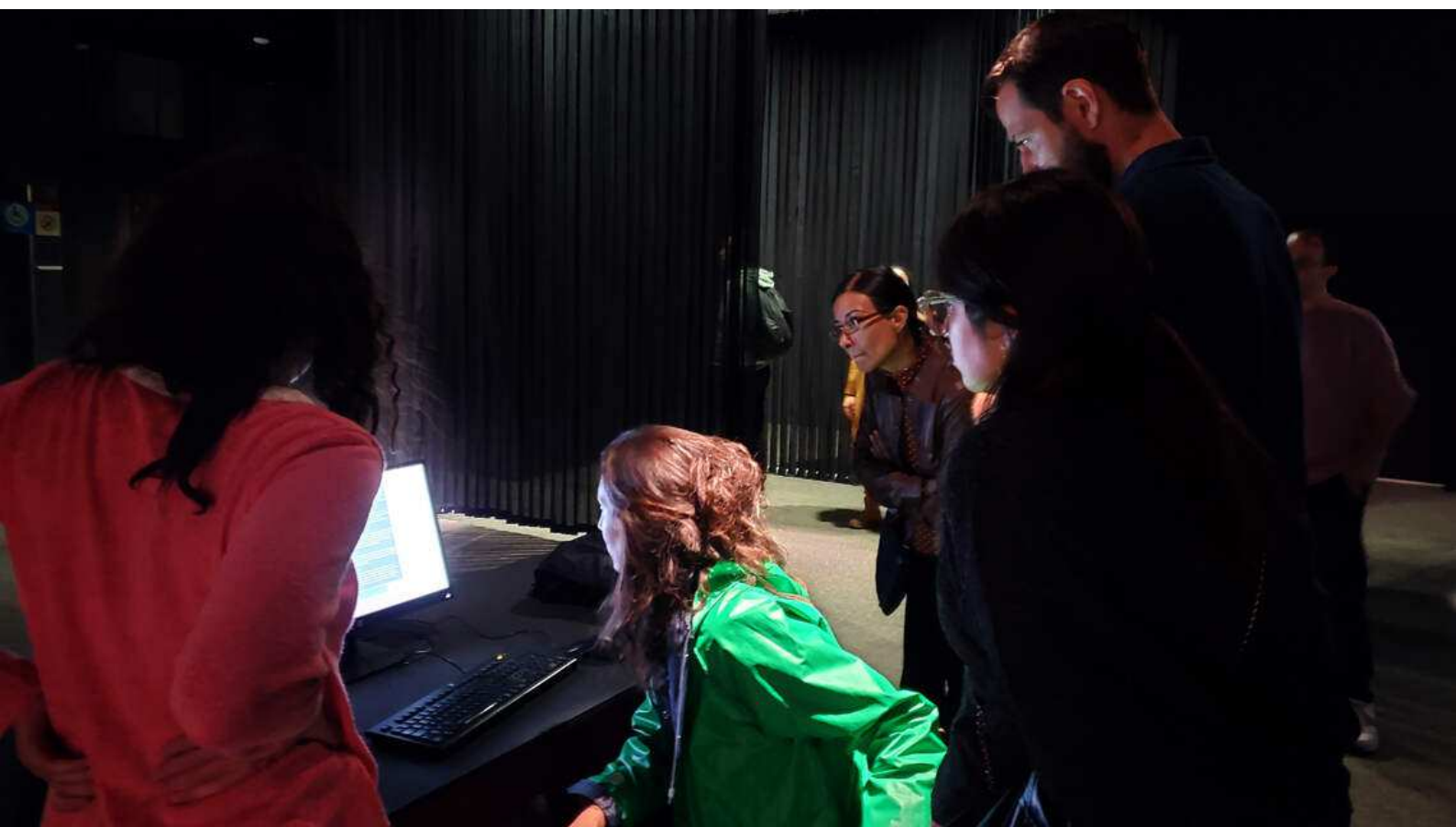
Cecilia, as installed at Ghost Agency's exhibition, Desde la Ceguera, at Centro de Cultura Digital, Mexico City, 2023.