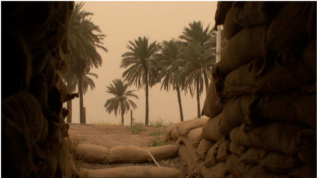
Image from the film. From a grenade attack during a shoot in Baghdad.

ISLAMOPHOBIA: Winner Scottish Muslim Awards Best Film.