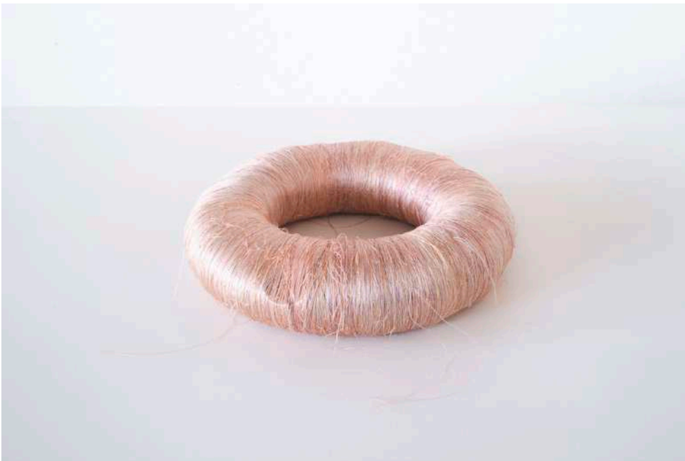
Extracts of care (2020) porcelain, silk 2020. 12x12x3 cm.