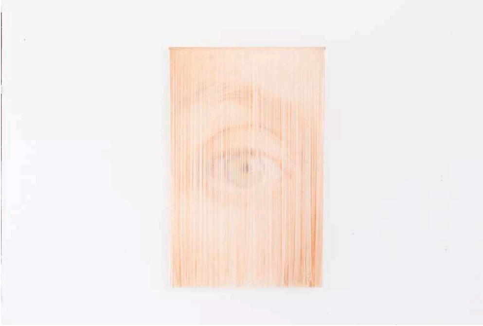
The skin's gaze silk, 2022. 70x120 cm.

Skitse til udstillingen - løbende projekt