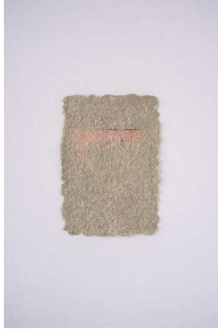
Negotiations between heaven and earth, fennel stalk, silk, olive, 2021. 19x13 cm.