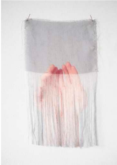
Loose Gatherings (pt.5) silk, 2020. 32x18 cm

Skitse til udstillingen - løbende projekt