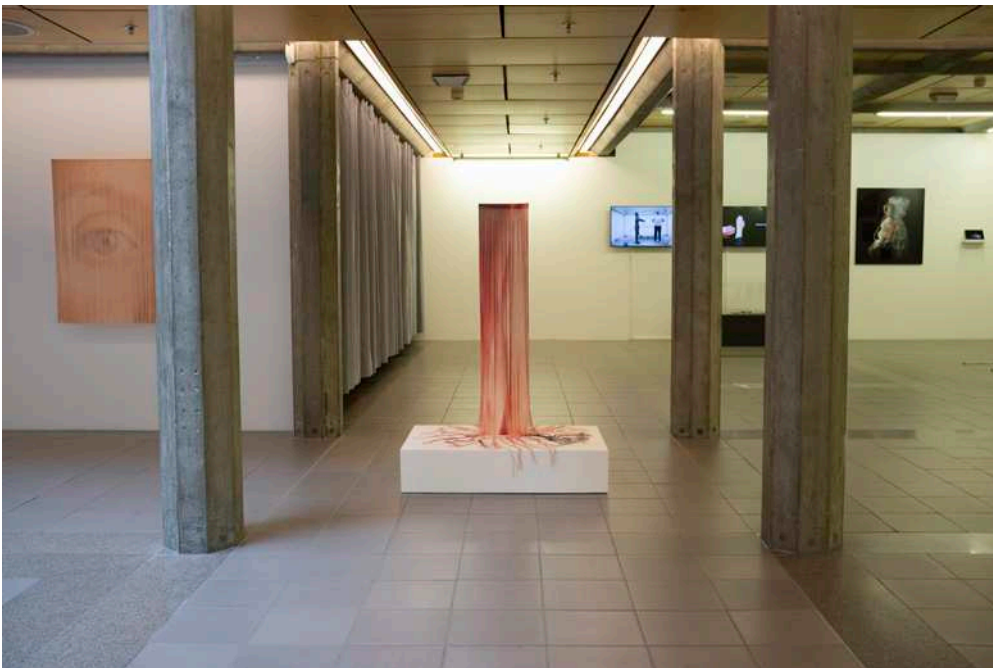
Split Observations (installation view), silk, 2022. Dimensions variable