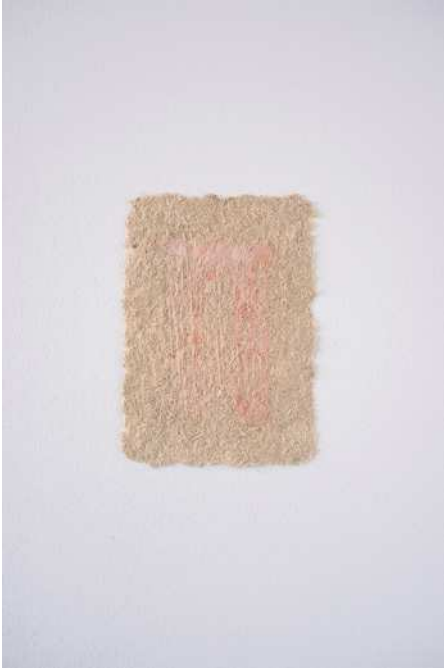
Negotiations between heaven and earth, fennel stalk, silk, fig, 2021, 17.5x12.5 cm

Skitse til udstillingen - nurturing manoeuvres/in search of space