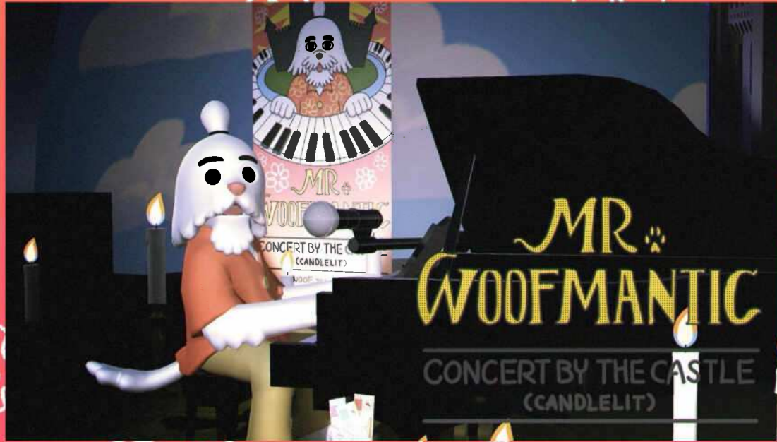
Mr Woofmantic artwork

Mr Woofmantic is a singer-songwriter dog, who lives in a videogame. He sings about dog life and plays jazz piano, with empathy and humor.