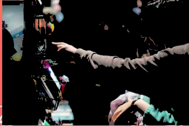
Art market – games and more

We, the team behind Mr Woofmantic will also have a little exhibition about BTSs (concept art, work in progress, etc.) of Mr Woofmantic universe, the video game world that Mr Woofmantic lives in.