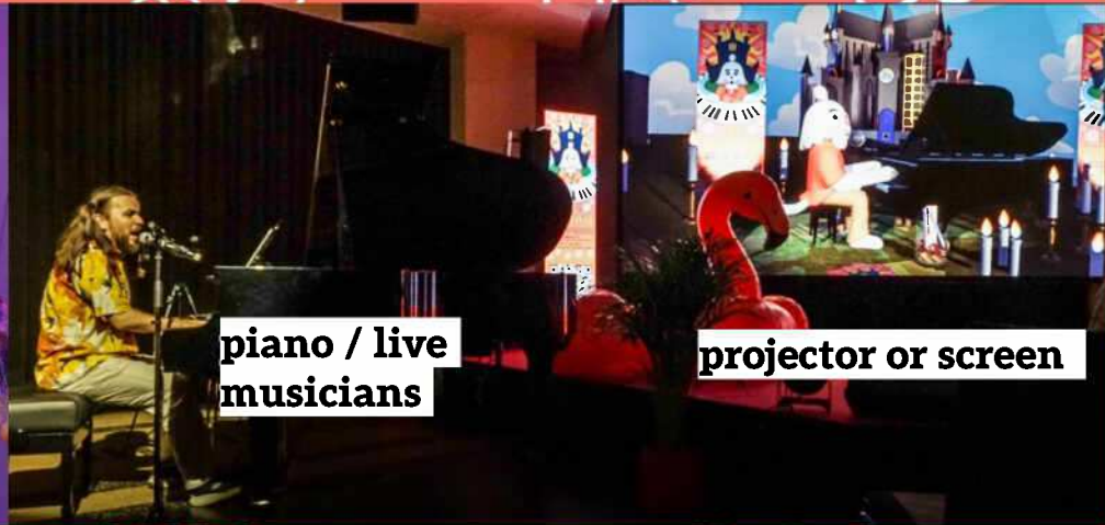
piano / live musicians