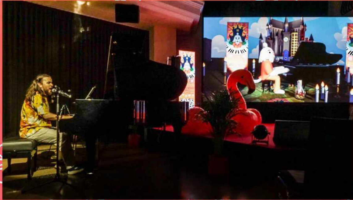
Photo from the opening concert of A MAZE. / Berlin festival, 2025