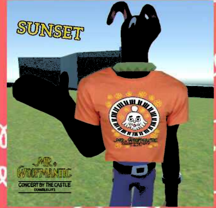
Mr Woofmantic t-shirts