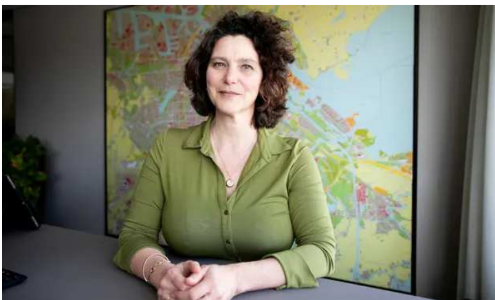
Marieke van Doorninck, deputy mayor of Amsterdam.

The central premise is simple: the goal of economic activity should be about meeting the core needs of all but within the means of the planet. The "doughnut" is a device to show what this means in practice.