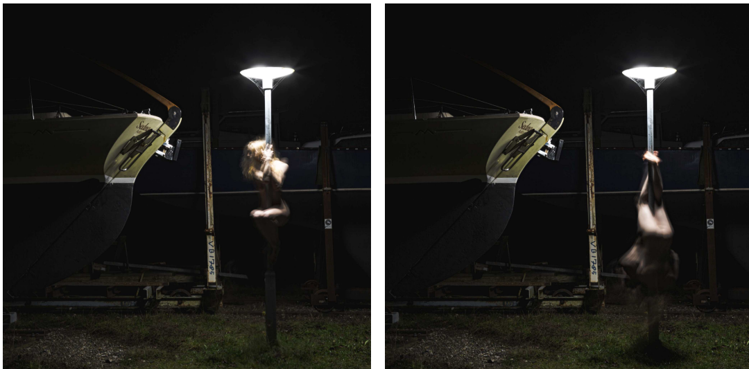
Aalborg Wildlife Photography (2021)

Utilizing this technology, I intend to create an artwork portraying the queer body as a transformative agent embodied in the goddess of the moon, Selene. The work positions the role of the queer body in society as witch, as magician, as catalyst, as activist, as rebel - and as goddess. The artwork celebrates the strength in the eye of adversity and the innate transformative powers I have felt in my own body, and in those of my community.