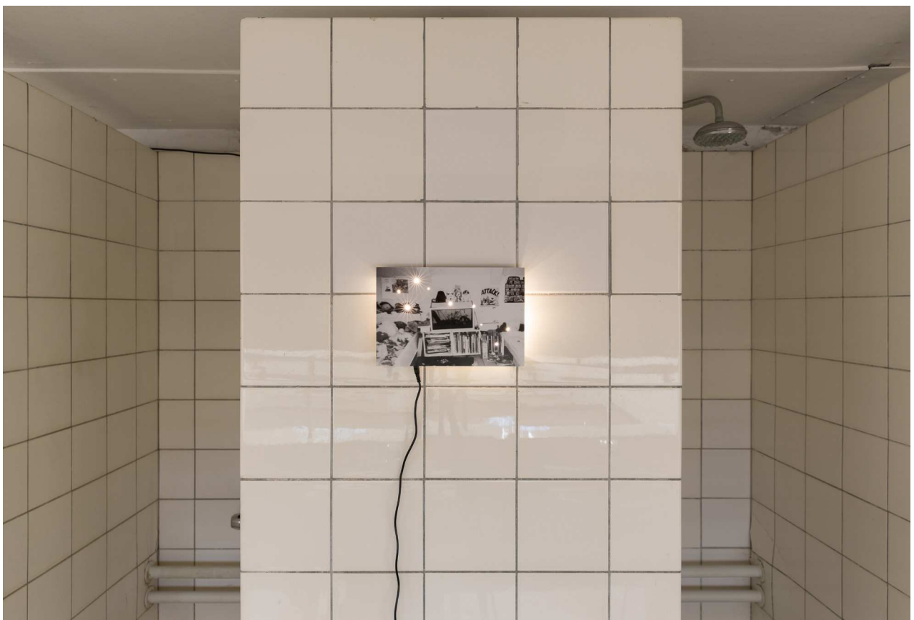
Installations billeder fra udstillingen Grounding, Connecting (2022)