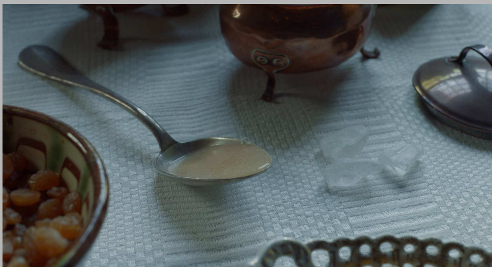
Recorder (2020), 15 min. Link: https://vimeo.com/436877630/093e2f8ddd