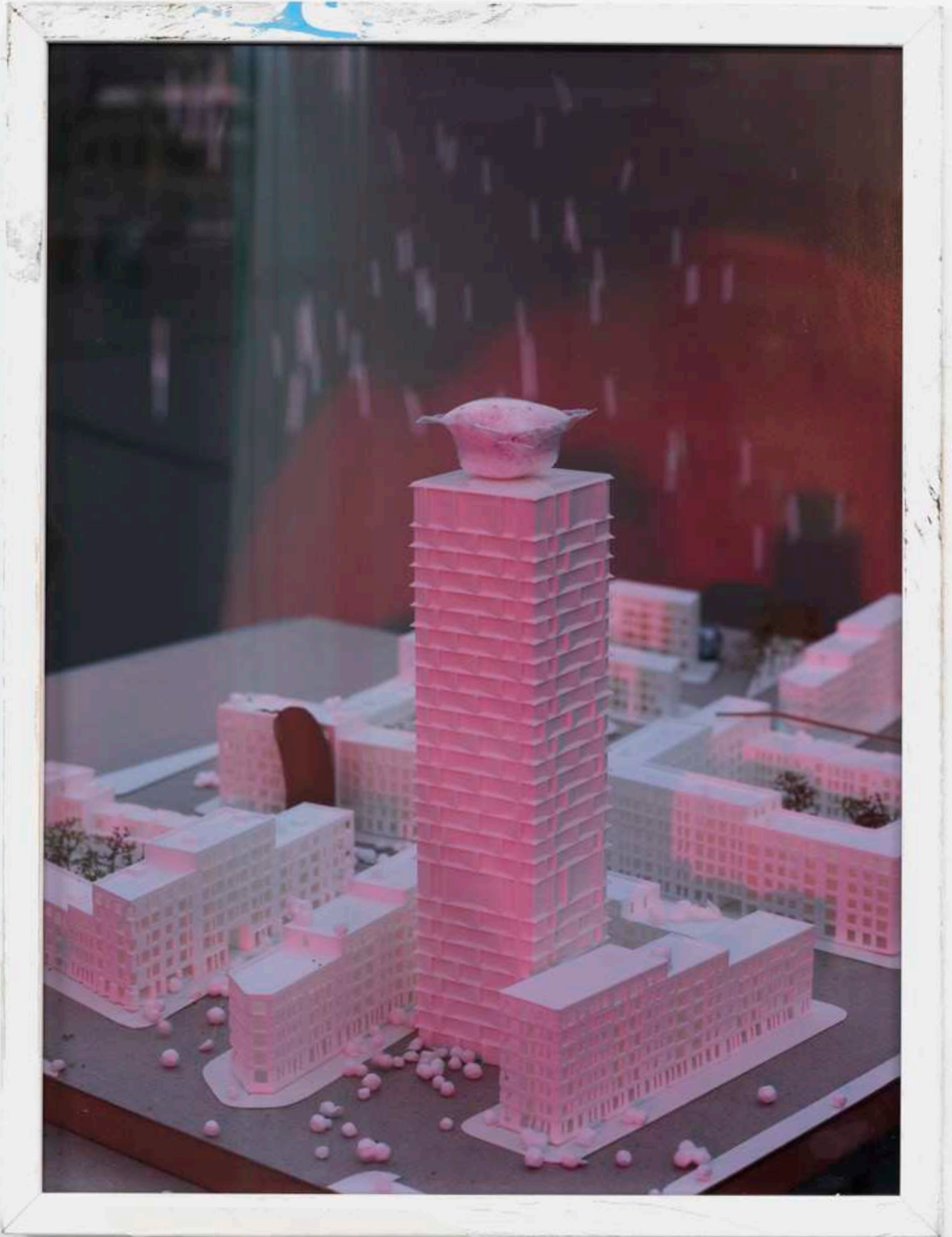
12 AUG 20:30, c-print i modificeret ramme (2019)