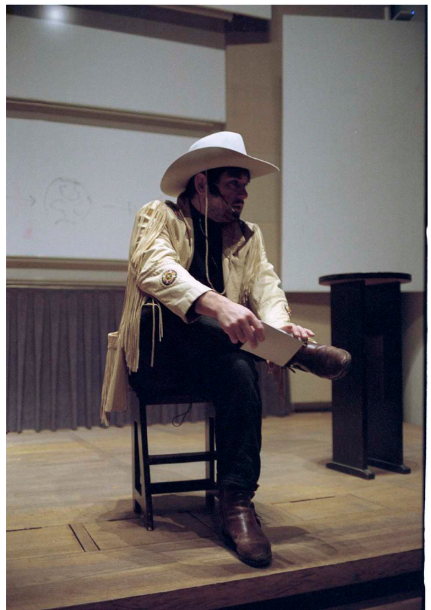
Storyteller, world maker - talker (2022), performance lecture på Stockholm School of Economics