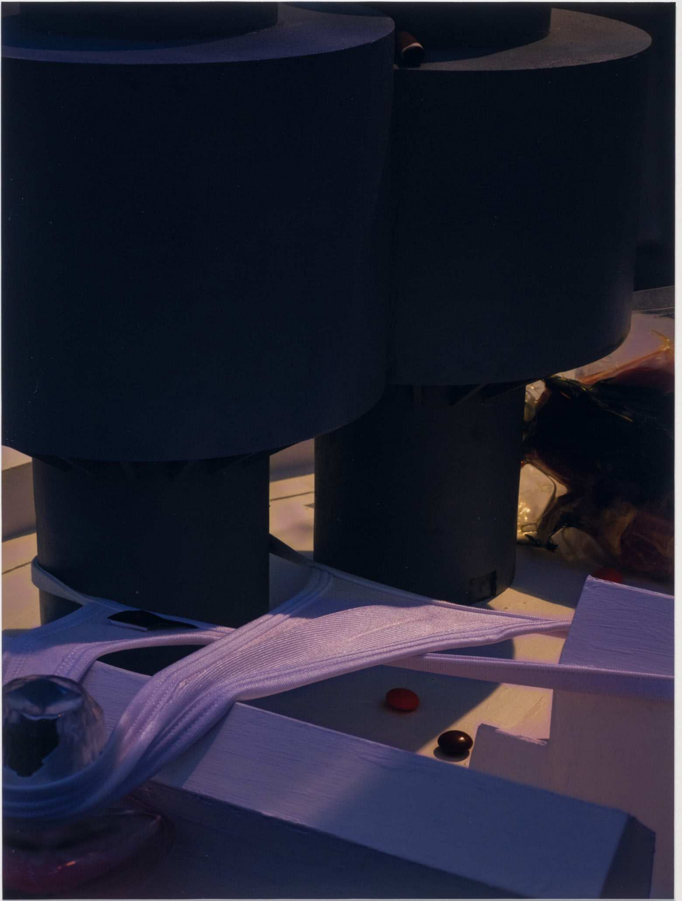
23 JUL 11:03, c-print (2019)