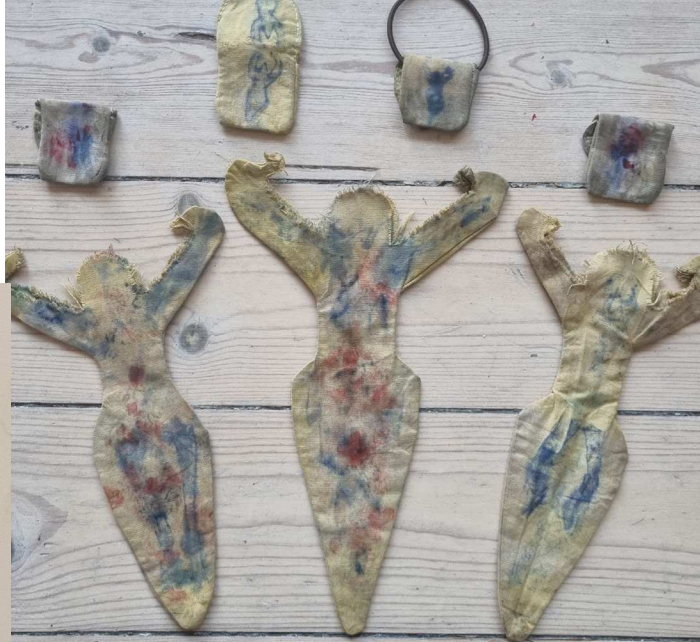
Kore (soft), 2023 tekstil, 170x70x50 cm på orange/gult tekstil