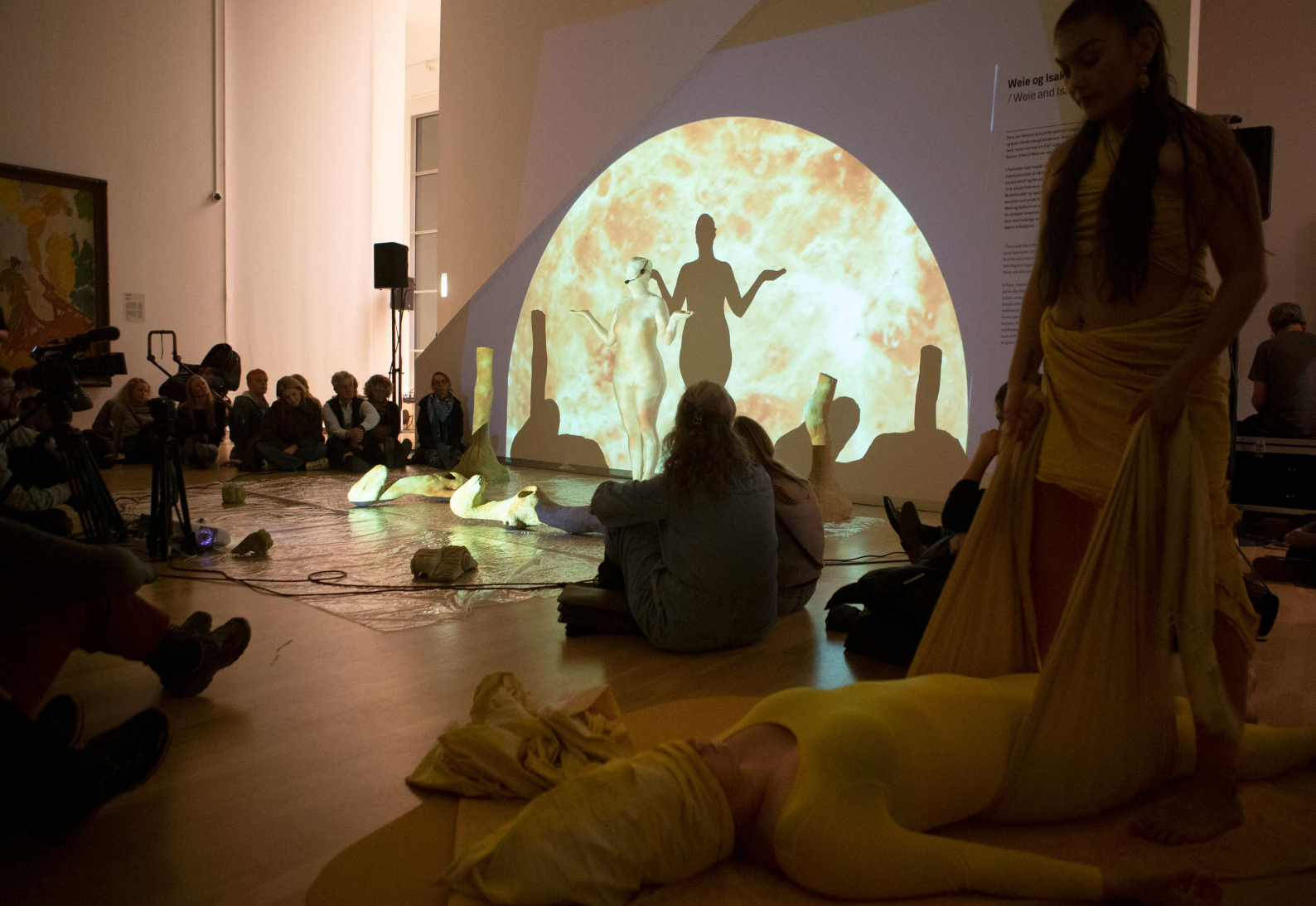
Dear Daughter/Sen_sing_inannainanna (Russ, Shiva, Klein) #5, 2022 45 min. live performance og a/v skulptur installation 500x500x350 cm video dokumentatio, 1 minuts uddrag: http://nannalyscholthansen.com/?page_id=1120