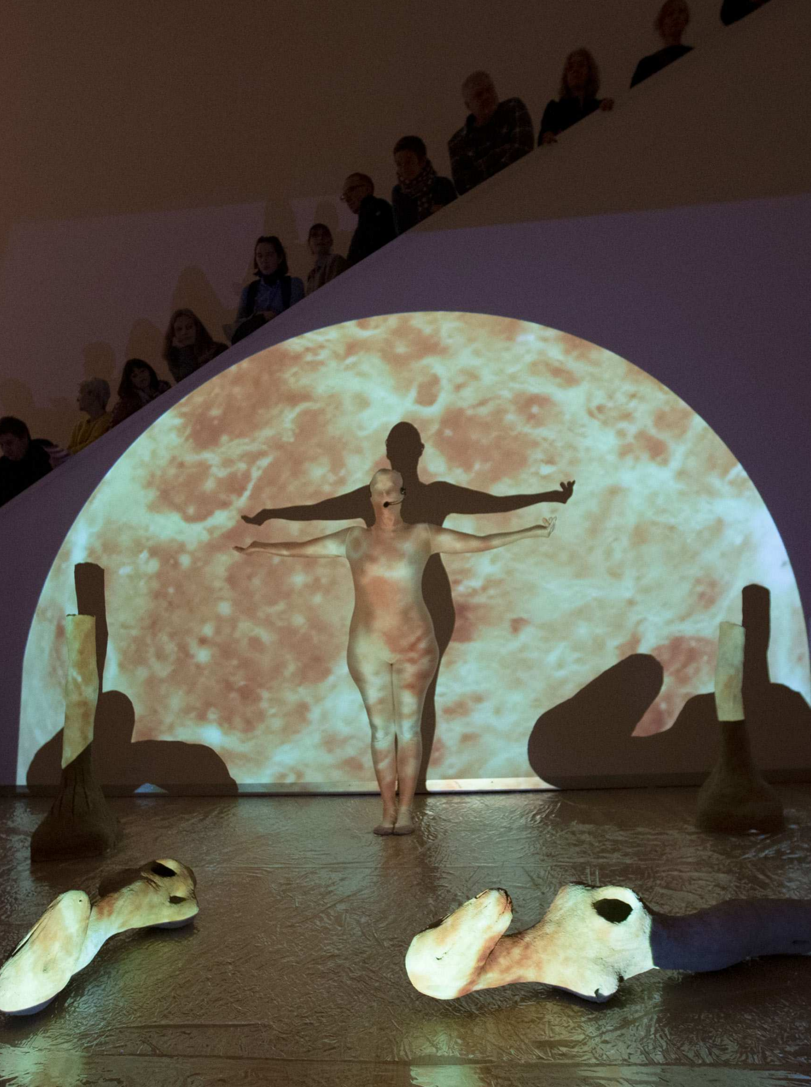
Dear Daughter/Sen_sing_inannainanna (Russ, Shiva, Klein) #5, 2022 45 min. live performance og a/v skulptur installation 500x500x350 cm SMK Statens Museum for Kunst November 2022