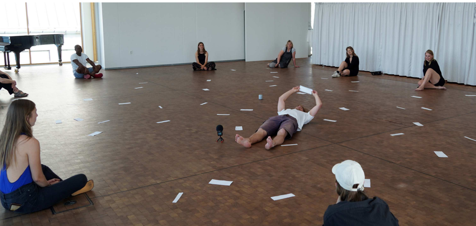
Voice of Nammu, 2021 60 min. performance workshop i samarbejde med F.eks på Utzon Center i Aalborg, 2021