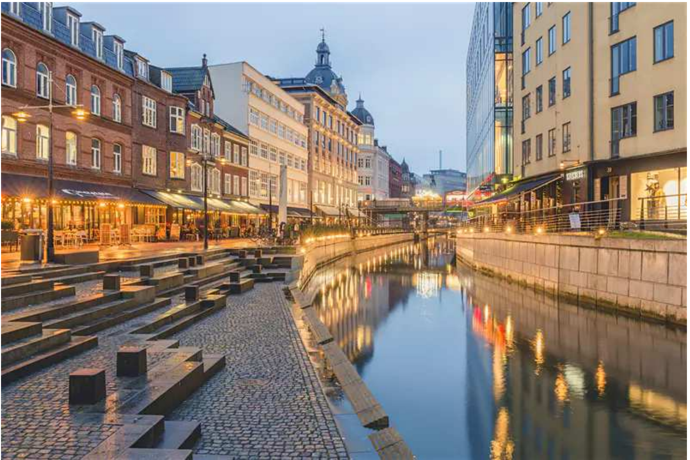
Copenhagen's beautiful neighbour, Aarhus, is perfect for a weekend getaway