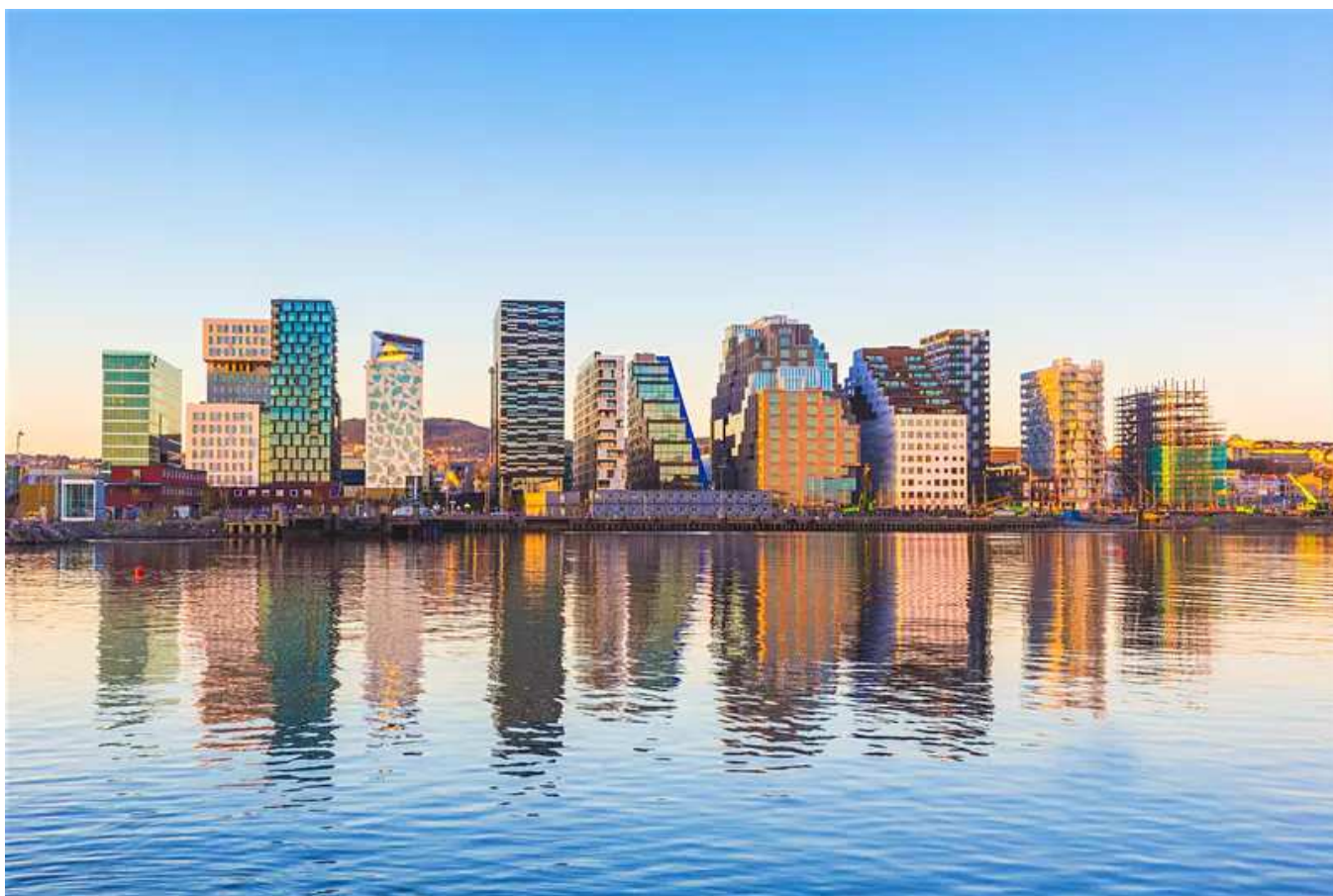
Modern buildings in Oslo, Norway, with their reflection into the water

But few major European cities have escaped the spectre of overtourism, and reports suggest Copenhagen ( https://www.lonelyplanet.com/news/2019/08/20/copenhagen-overtourism/ ) is now suffering from too much love, with effects ranging from crowded tourist hotspots to noise pollution. Here are five lesser-trodden Copenhagen alternatives which capture some of that city's appeal, while being treasures in their own right.