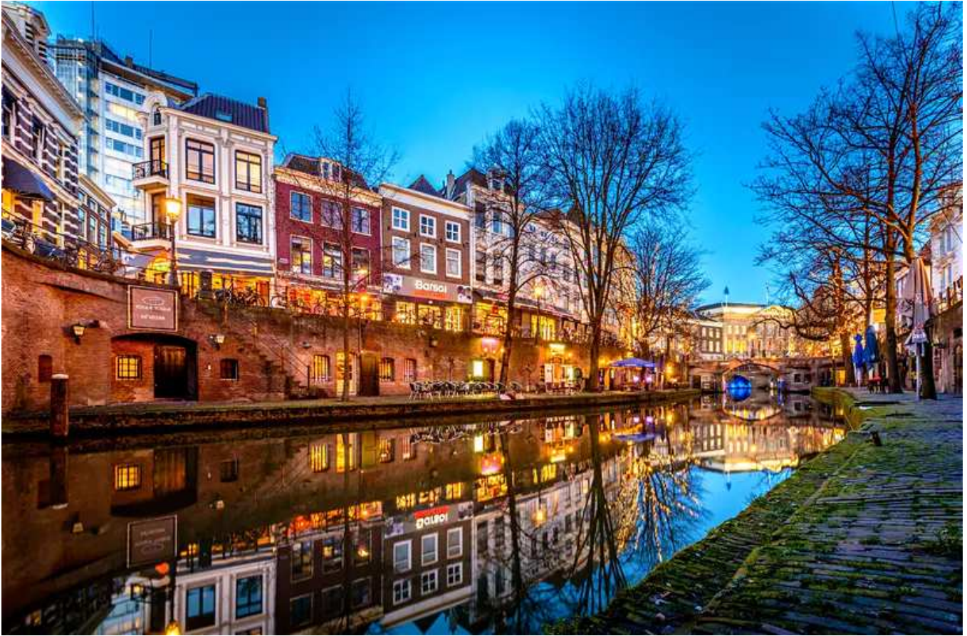
Spending beautiful evenings on the canalside in Utrecht

( https://www.lonelyplanet.com/scotland/glasgow/travel-tips-and-articles/glasgows-ten-best-pubs-and-bars/40625c8c-8a11-5710-a052-1479d2756ed5 ), and you'll be well on your way to understanding the meaning of both: that Glaswegian sense of humour is legendary for a reason.