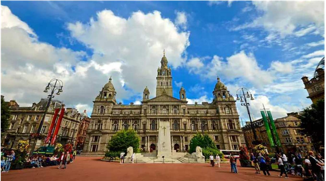
The stunning architecture of George Square in Glasgow

the fact that nature is only ever a few minutes away. The hypermodern, white marble Oslo Opera House ( https://www.lonelyplanet.com/norway/oslo/entertainment/oslo-opera-house/a/poi-ent/1289995/1342177 ), rises elegantly from the regenerated harbourfront area, while, at Tjuvholmen, renowned modern art gallery Astrup Fearnley Museet ( https://www.lonelyplanet.com/norway/oslo/attractions/astруп-fearnley-museet/a/poi-sig/415214/1341966 ) nestles beside a small urban beach and harbour baths to offer high-brow and casual waterside experiences alike. But if you feel more at home in a less polished setting, hop on a bus to Grünerløkka ( https://www.lonelyplanet.com/norway/oslo/grunerlokka-vulkan ) for an unpretentious, all-you-can-eat buffet of buzzing bars, restaurants, and one-of-a-kind boutiques.