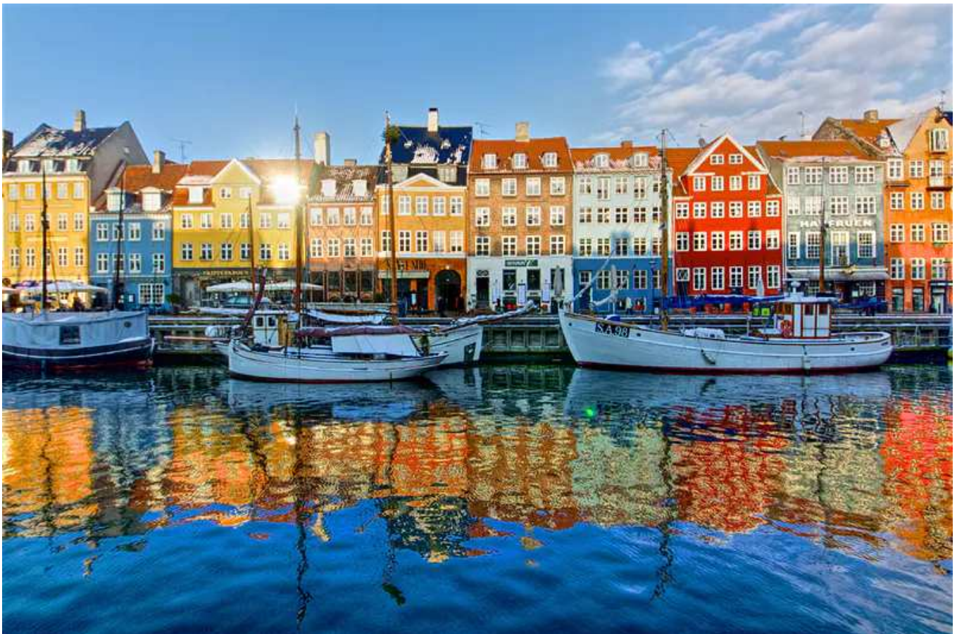
Brightly coloured waterfront facades of Nyhavn

The undisputed cool kid of Scandinavia, Copenhagen draws millions of visitors each year with its winning formula of historic charm, gastronomic brilliance, cutting-edge architecture and on-the-pulse nightlife. All this in the capital of a country repeatedly hailed as the world's happiest? It's obvious why Copenhagen is such an alluring destination.