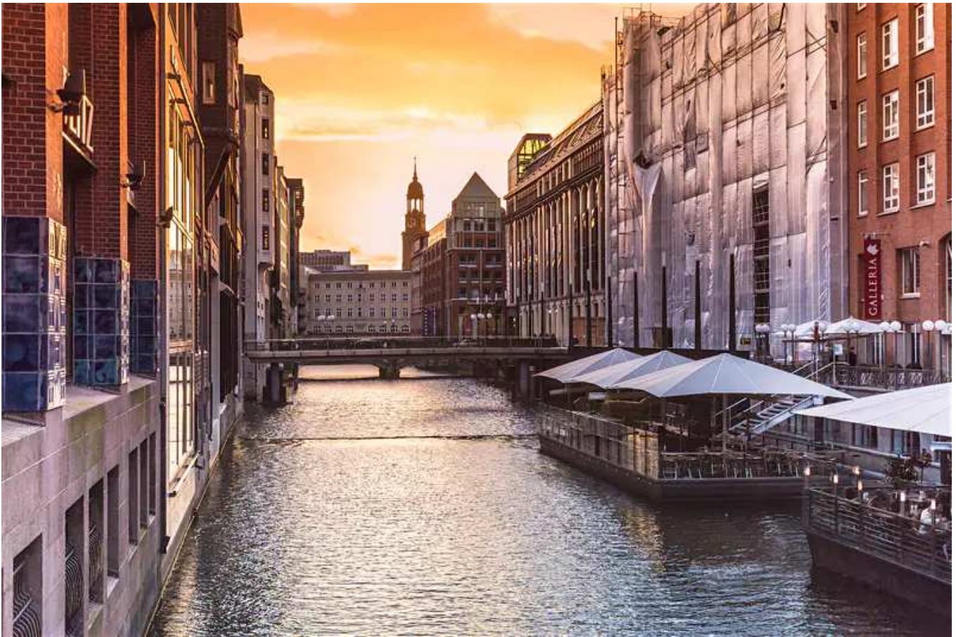
Spending beautiful evenings on the canalside in Utrecht