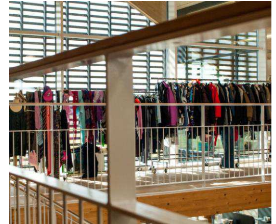
Secondhand shops are increasing in quality

Even if you think someone won't find a use for your old items, don't hesitate to donate! You never know what someone could use, and if it cannot be reused it could be recycled instead.