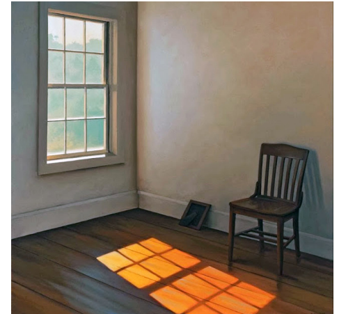
Vilhelm Hamershoi and Jim Holand represent natural light as a volume being framed by architecture