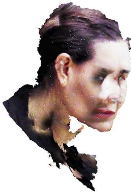
Portræt skabt via 3D scan printet på tekstil 2020.