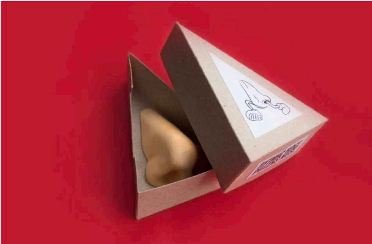
Putin's Nose 3D print 2019.