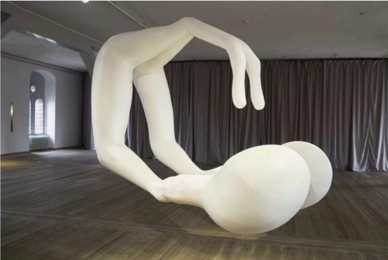
Aom Aom, 3D print Your Body In My Room, 2017.