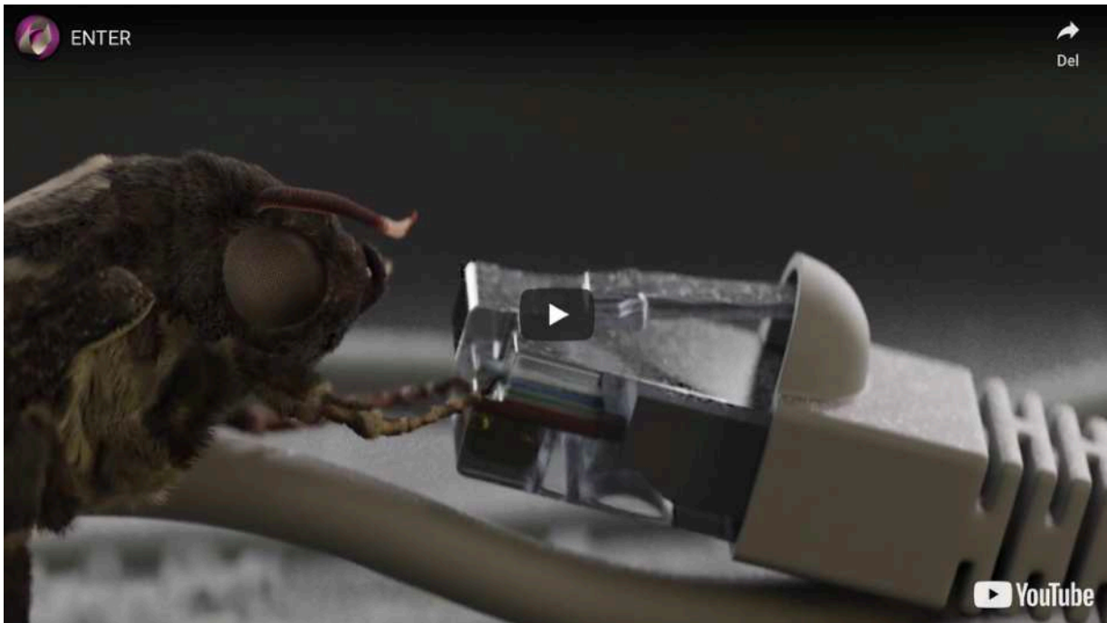
ENTER, 2018 HD-video, 7:40 min Videoværk kommissioneret af Statens Museum for Kunst, 2018.