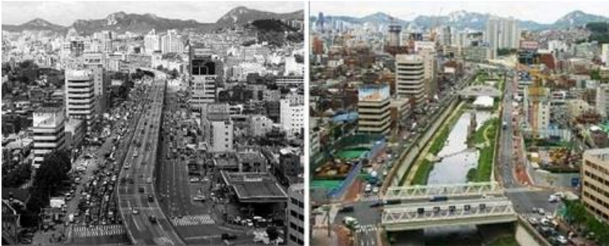
Figure 3. The before and after of the restoration of the Cheonggyecheon River in Seoul, South Korea