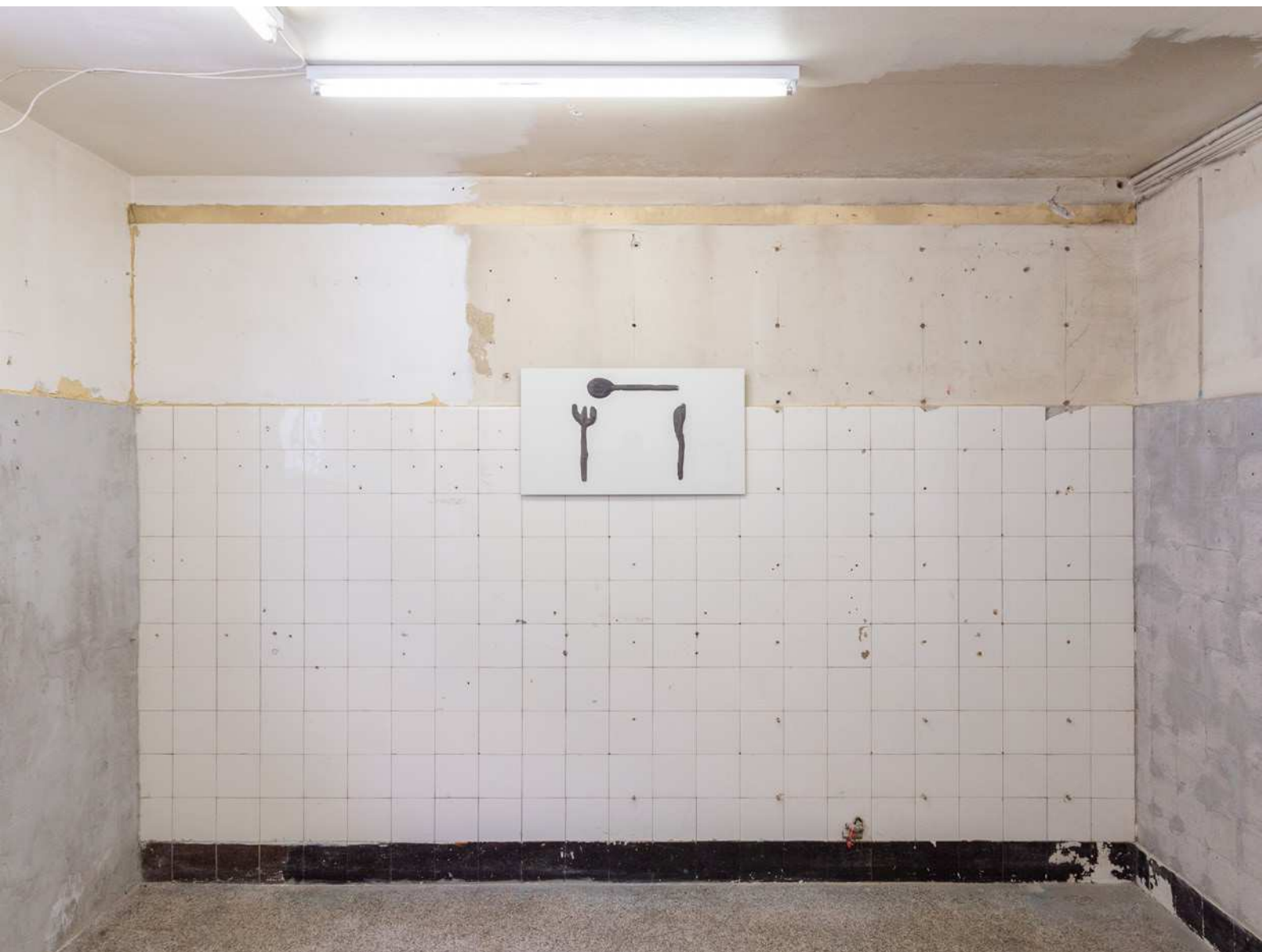
Mains sandstøbt jern monteret på aluminium 50 x 70 cm 2019