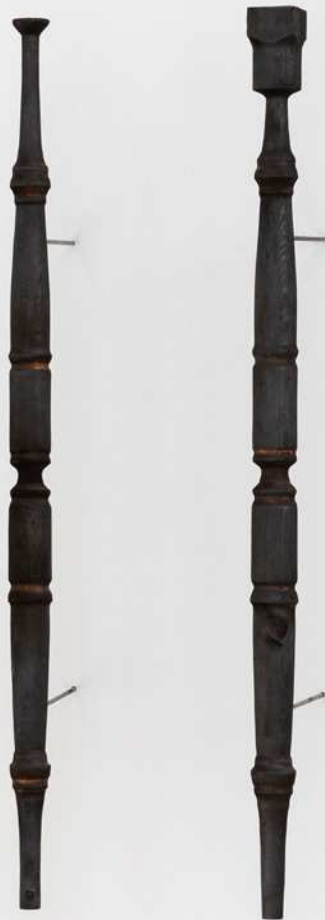
Scepters forkullet træ 30 x 90 x 20 cm 2021