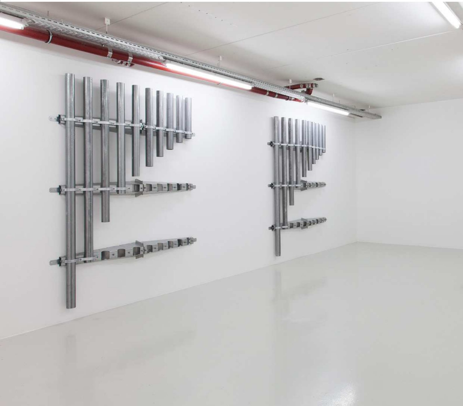
Instrument galvaniseret stål 250 x 198 x 22 cm 2021