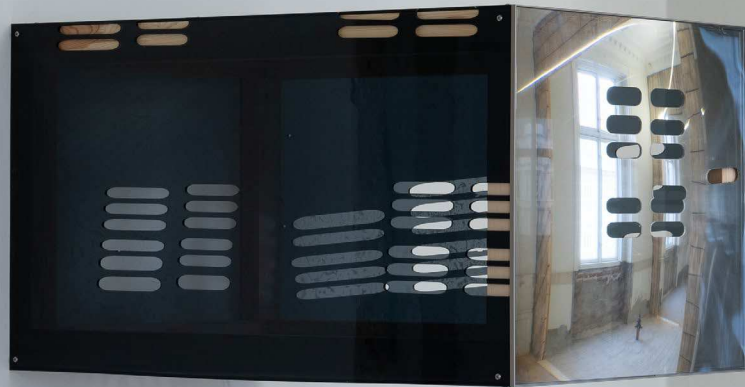
Trap safety mirror, acrylic, wood 82 x 60 x 50 cm 2023