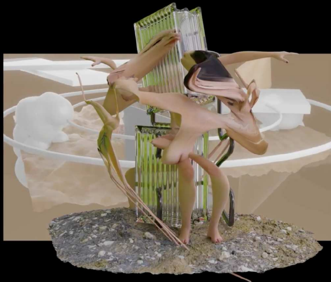
transformation and permanent safety from the passage of time.