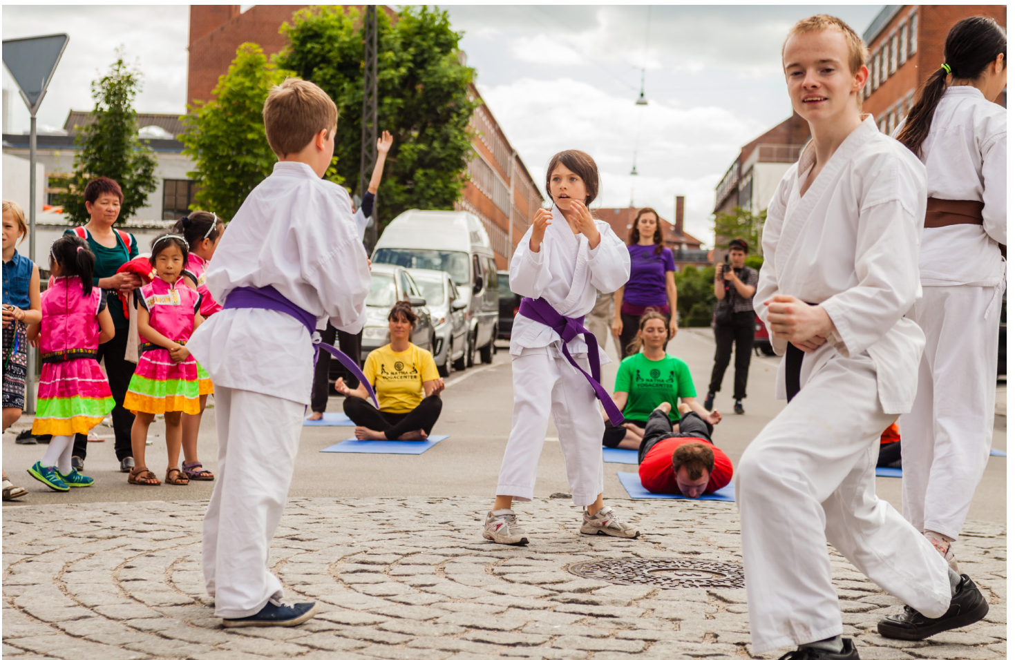
J&K, Forenede Fasaner - parade for Nordre Fasanvej, community project and parade (2 hrs), 2016