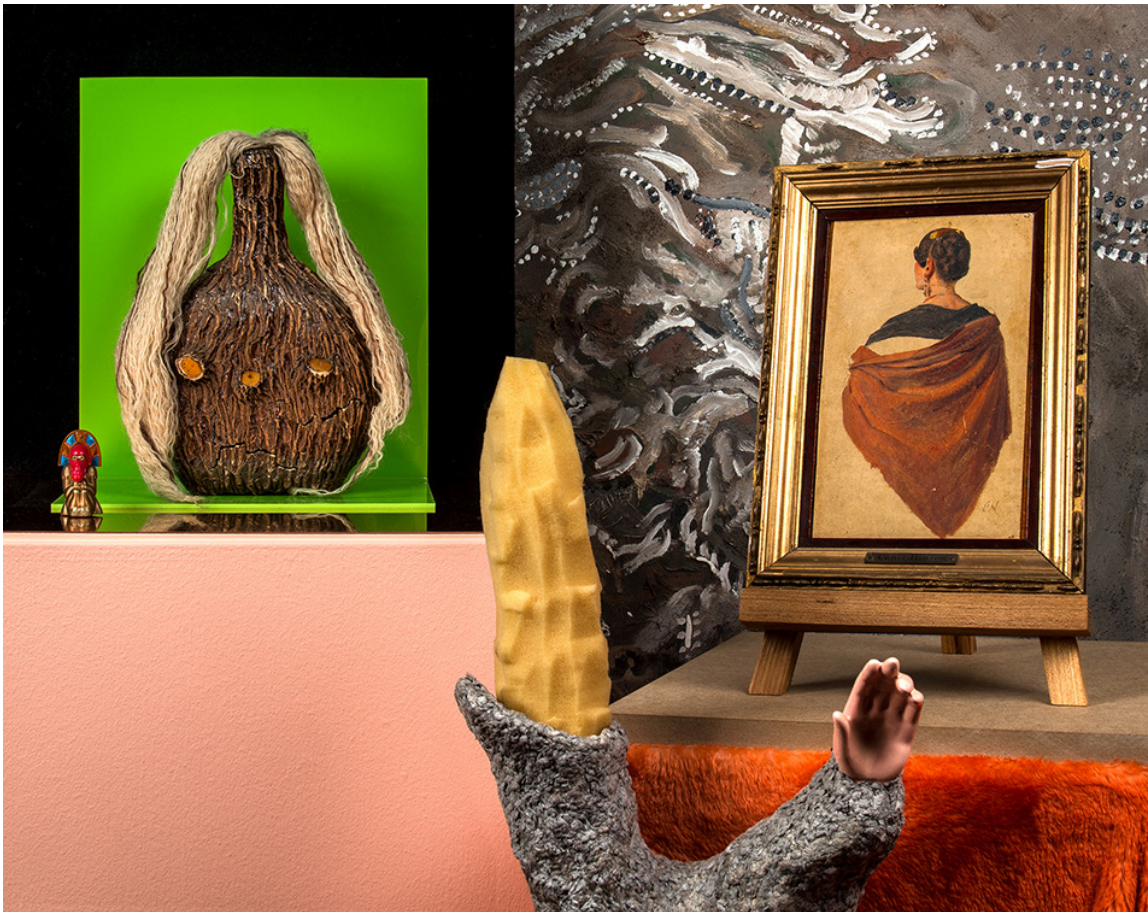
J&K, Social Practice I + II (Museum of O.O.O.) , photo, 100x80cm, 2015