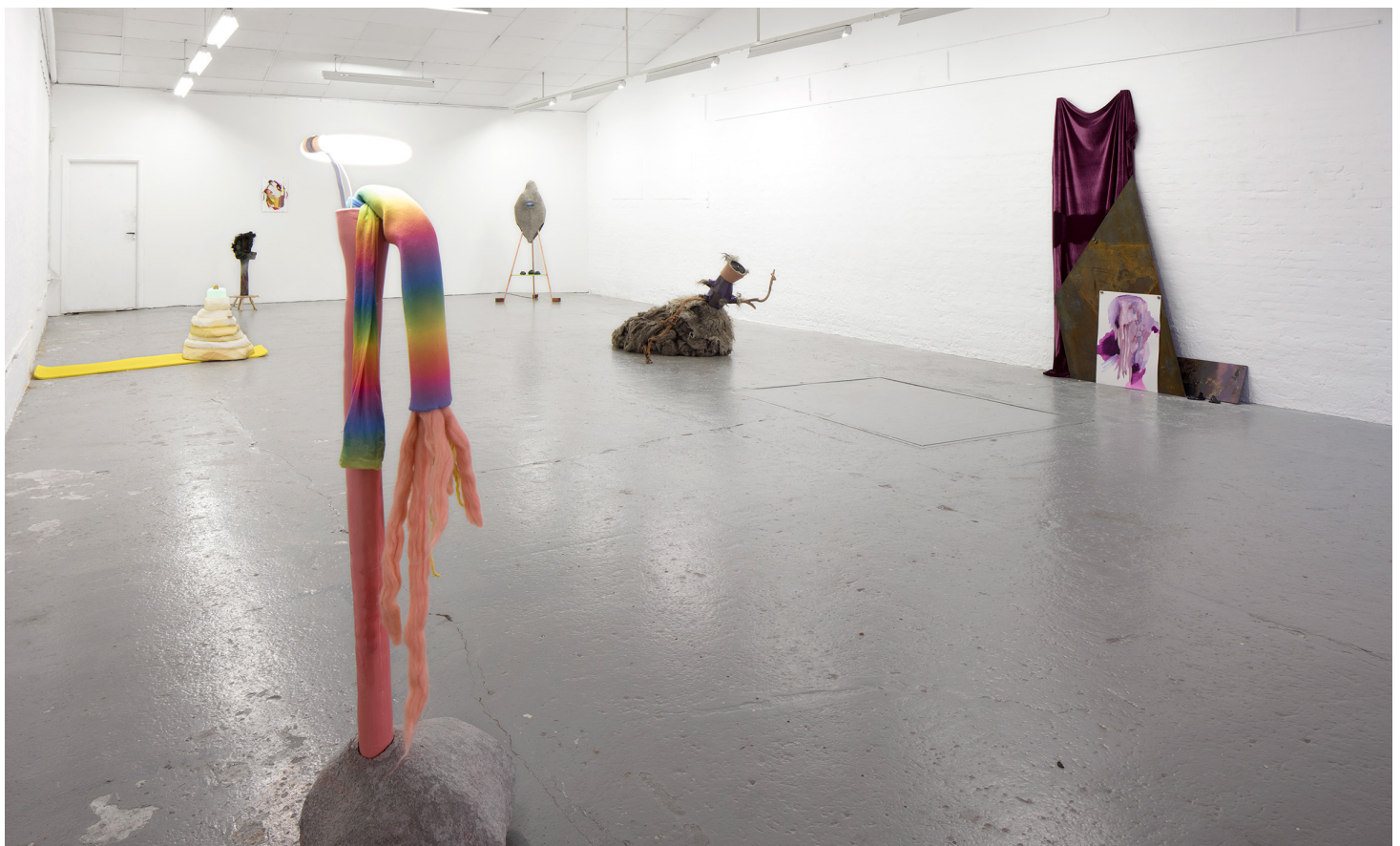
J&K, top left: Time Travel Case Log - Soul Retrieval , printed matter, top right: Warden of Wealth , mixed media sculpture, 120 x 40 x 40 cm, + I die all the time but I am always the same , mixed media on paper, 36 x 41 cm, bottom: Soul Retrieval , installation view, Ringsted Galleriet, 2017, photos: Morten K Jacobsen