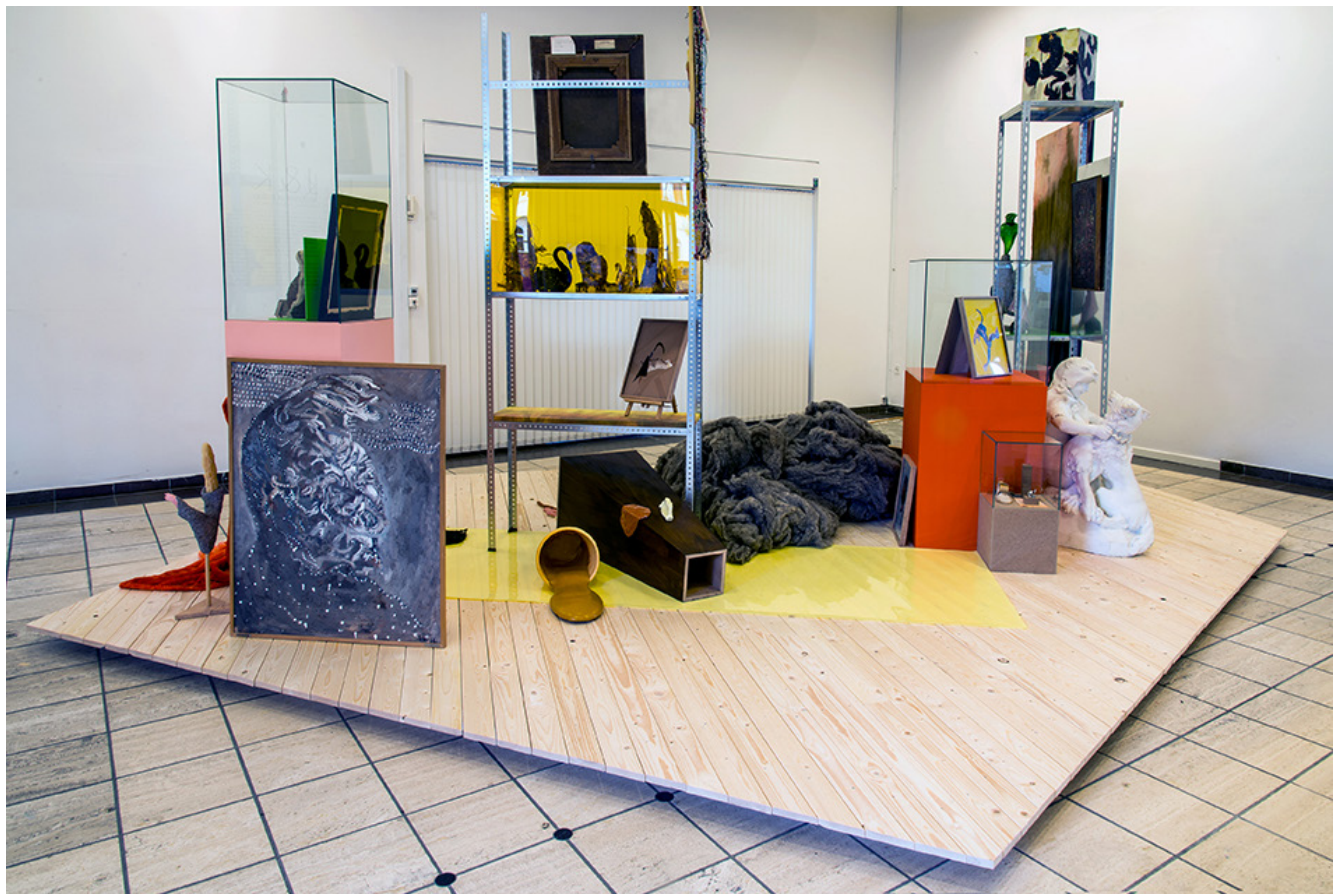
J&K, Museum of O.O.O. , installation detail, Kunsten Aalborg, 2015