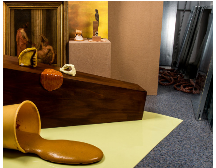
Top: J&K, Museum of O.O.O. , installation details, Kunsten Aalborg, 2015