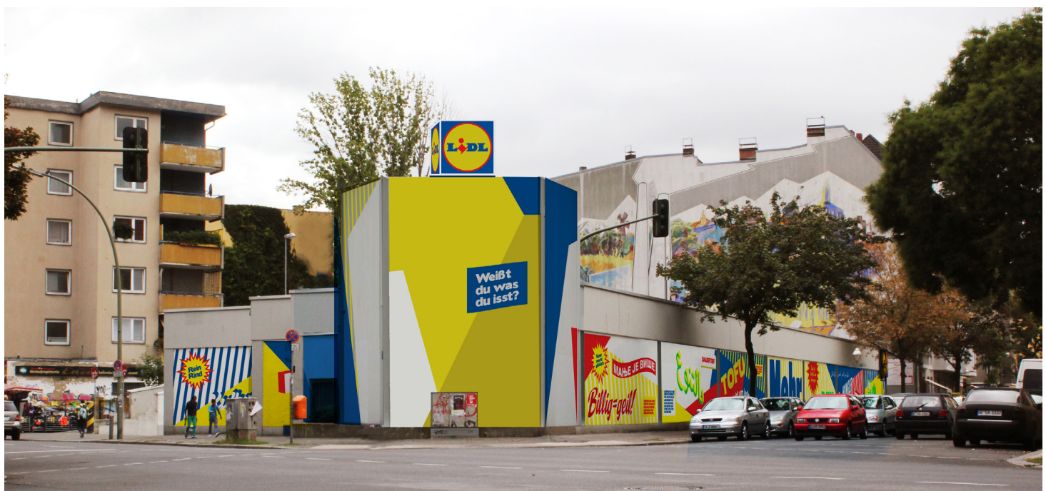
J&K, Wir sind was wir essen , 2013. Top right image shows implementation of interview text, middle right and large bottom image: street view with design implementation, narrow middle image shows part of design proposal.