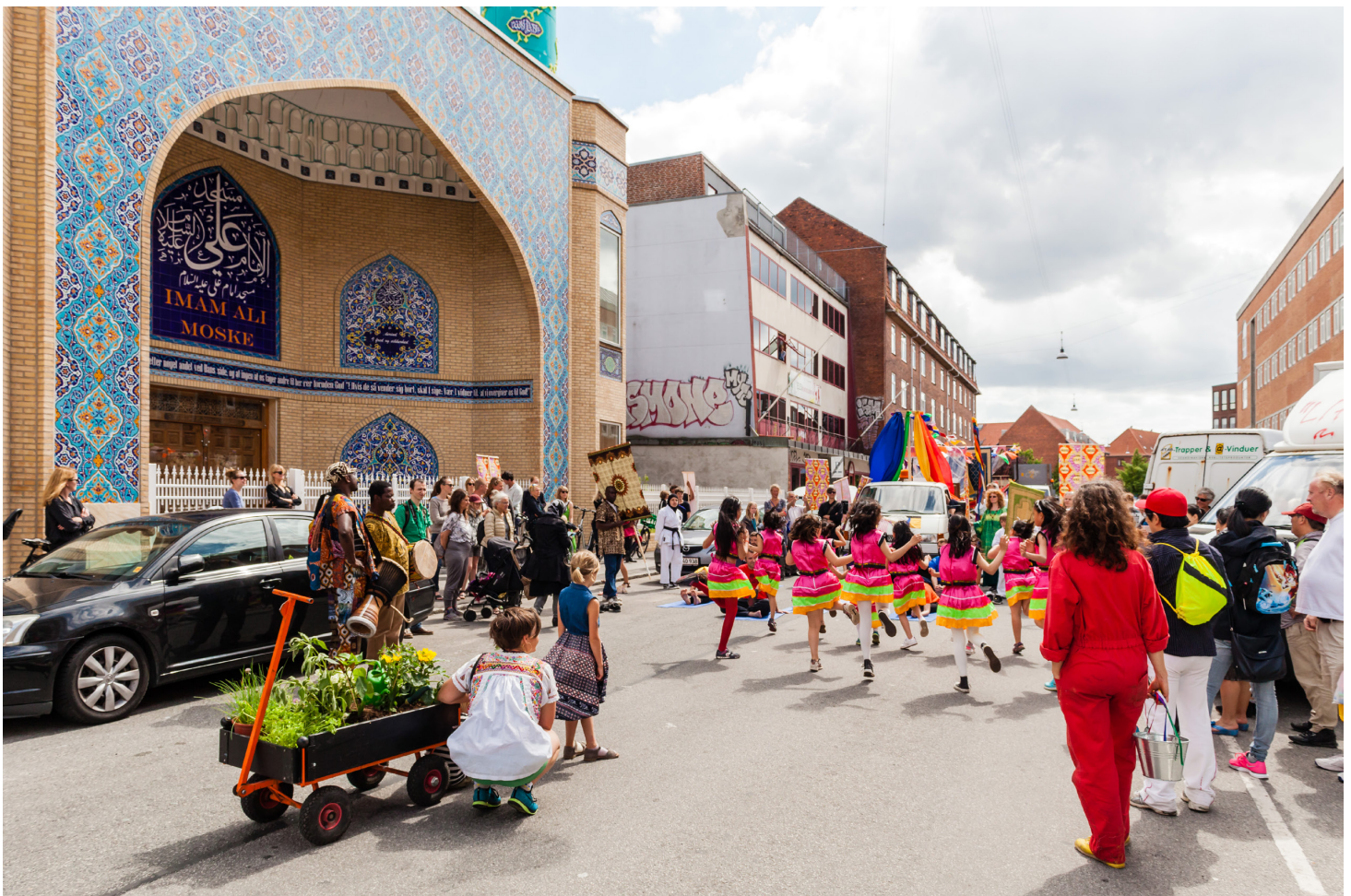
J&K, Forenede Fasaner - parade for Nordre Fasanvej, community project and parade (2 hrs), 2016