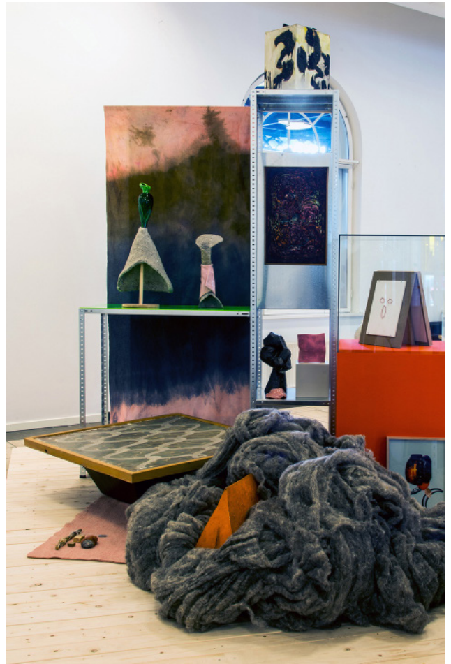
J&K, Museum of O.O.O. , installation detail Kunsten Aalborg, 2015