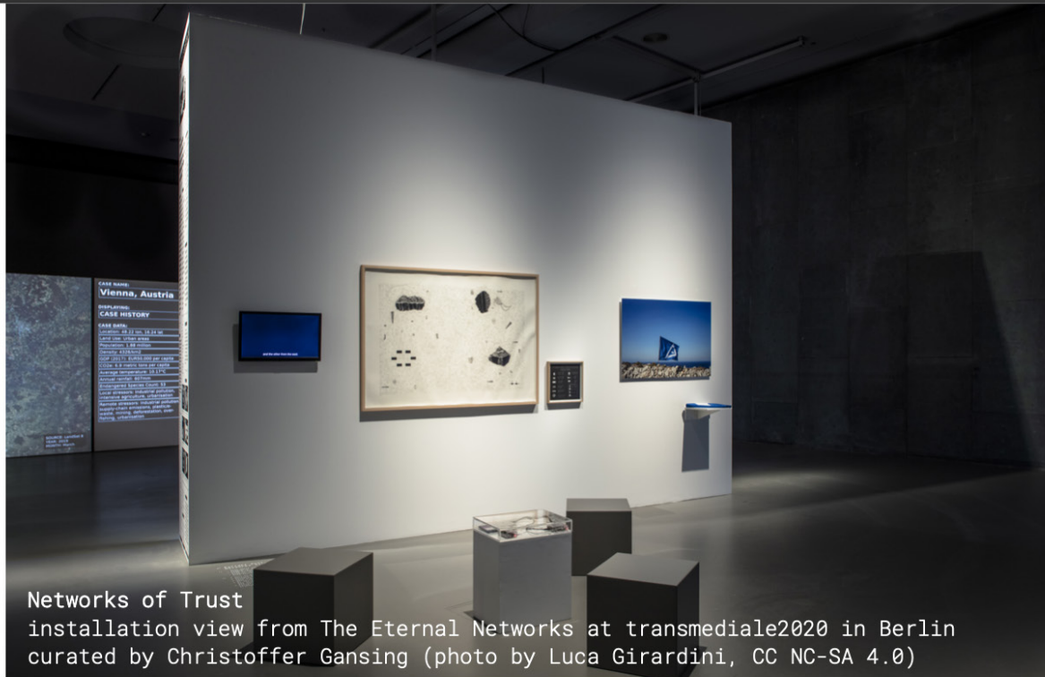
Networks of Trust installation view from The Eternal Networks at transmediale2020 in Berlin curated by Christoffer Gansing