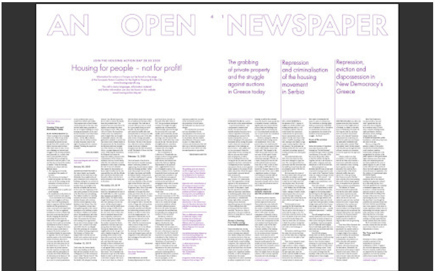
Theo Prodromidis: An Open Newspaper (You can't evict a movement) (2020)