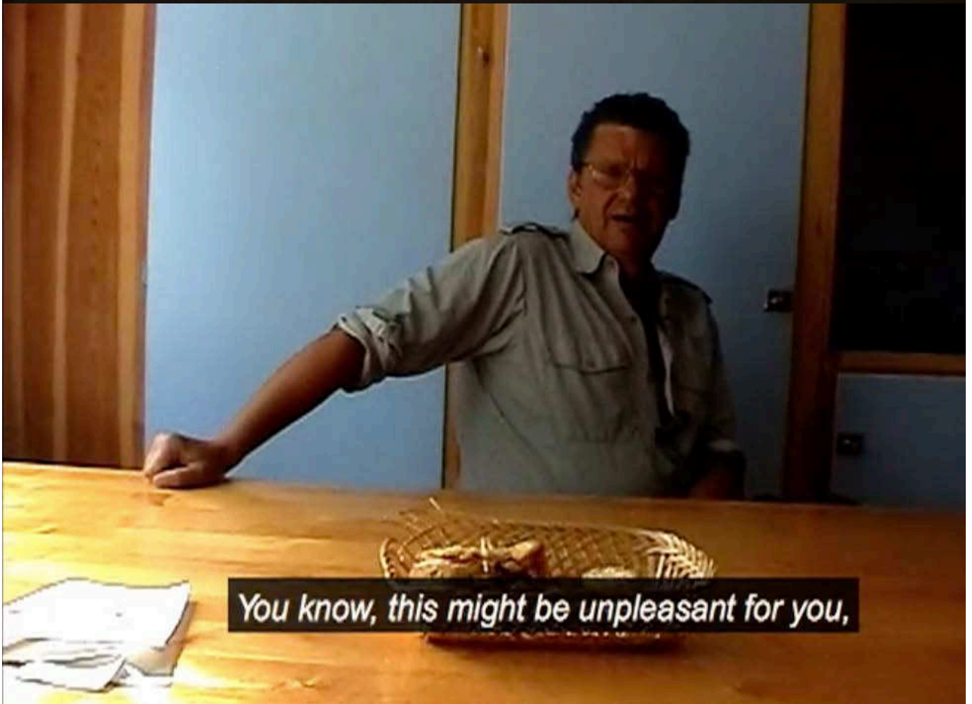
Above: Installation of Rika Djur 2019