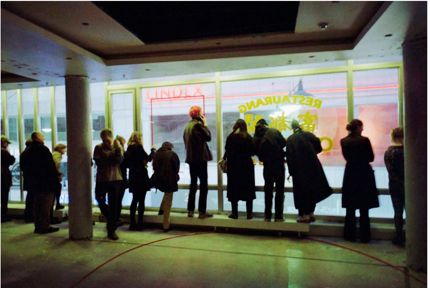
SoftCity, Performance by Coyote, 2019