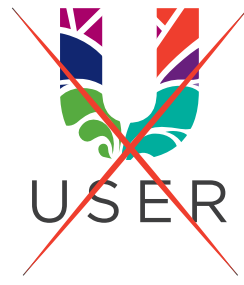
Do not use the logo without baseline