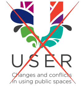
Do not add elements