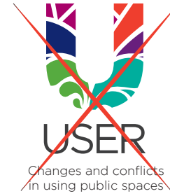
Do not change typography