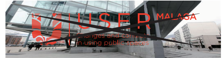
Use the right version on backgrounds