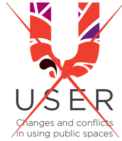
Do not change colours