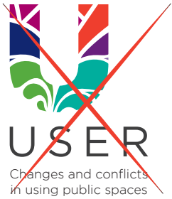
Do not change the alignment