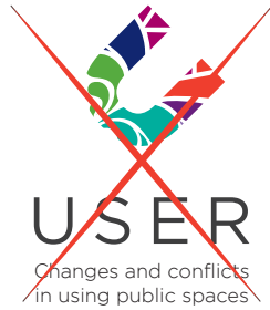
Do not move or scale elements separately