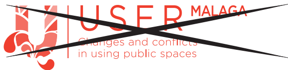
Keep the homothety