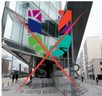
Use the right version on backgrounds